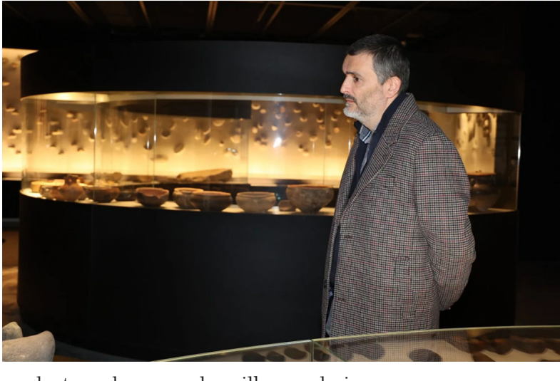
products such as cereals, milk,