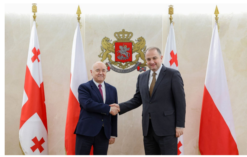
Monitoring Mission (EUMM). Cooperation in military education, joint participation in multinational exercises, and col-