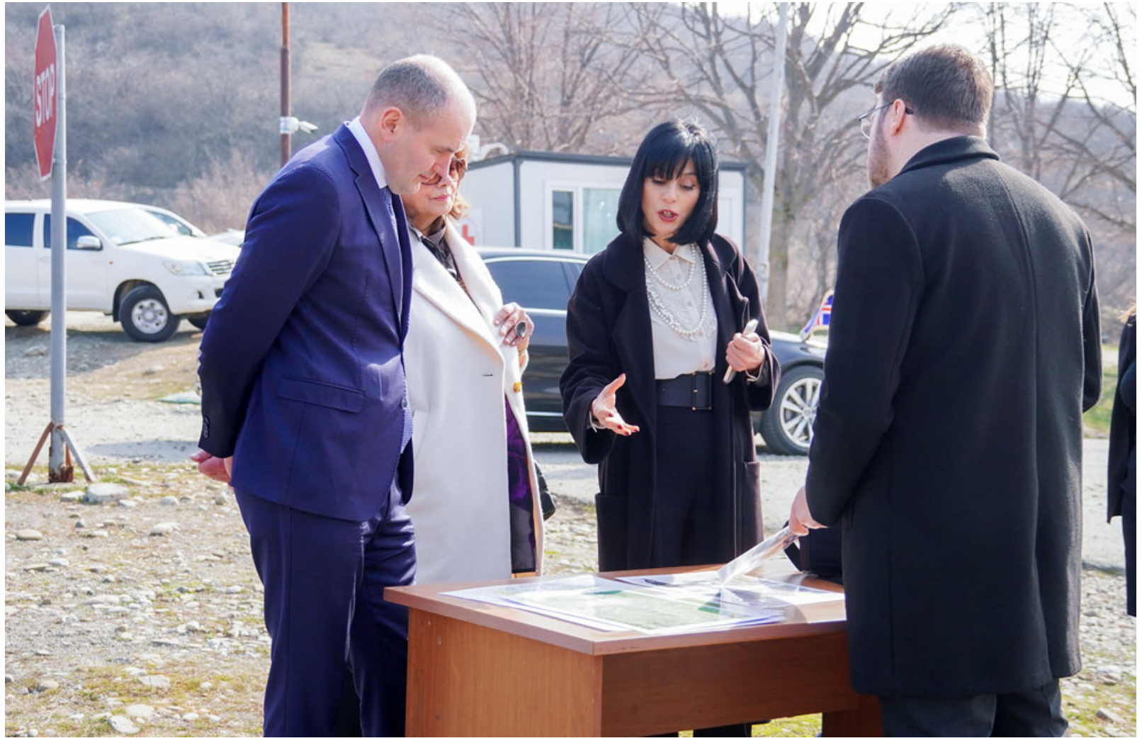
By Liza Mchedlidze

President of Iceland, Guðni Th. Jóhannesson, visited the village of Odzi near the occupation line during his official visit to Georgia, along with Minister of State of Georgia, Thea