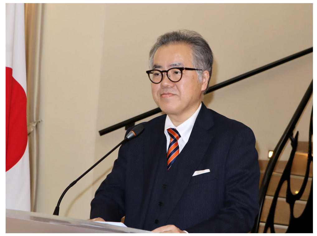
H.E. ISHIZUKA Hideki

USD, in addition to other grant schemes. The GGP program aims to support human security in Georgia in the following priority fields: environment protection, agriculture, infrastructure, healthcare, social care and education.