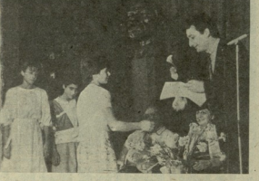
შენიშნული მოწინააღმდეგეობის შემთხვევაში... (Text describing the group and their role.)