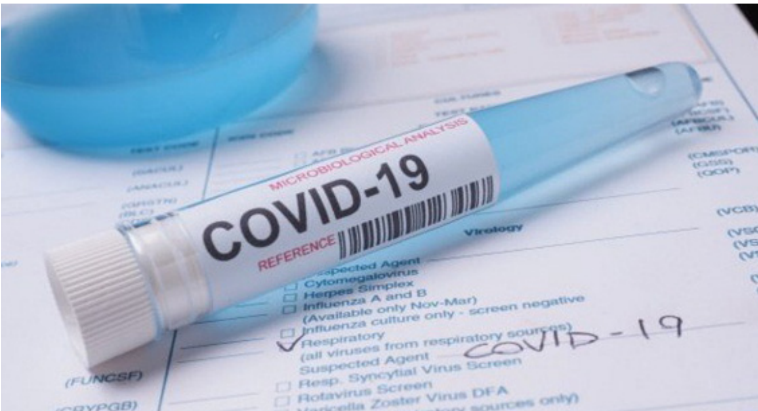
The equipment to be purchased for the fight against the pandemic.

An ability to rapidly diagnose the virus is of invaluable help in curbing the exponential spread of the virus in many countries. Bosch's new, fully automated rapid test can help medical facilities such as doctors' offices, hospitals, laboratories, and health centers provide fast diagnoses.