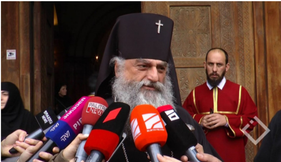
The metropolitan of Akhalkalaki and Kumurdo, bishop Nikolozhi hopes the congregation shows up on Easter liturgy.