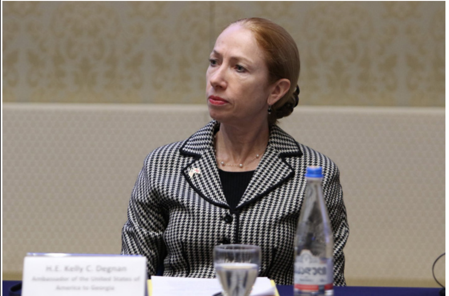
Kelly Degnan promising Georgia 2,000 rapid tests.

virus. According to Degnan, the Embassy's Defense Threat Reduction Agency is planning to purchase 100,000 GEL worth of personal protective equipment and hand it over to the Georgian Ministry of Health.