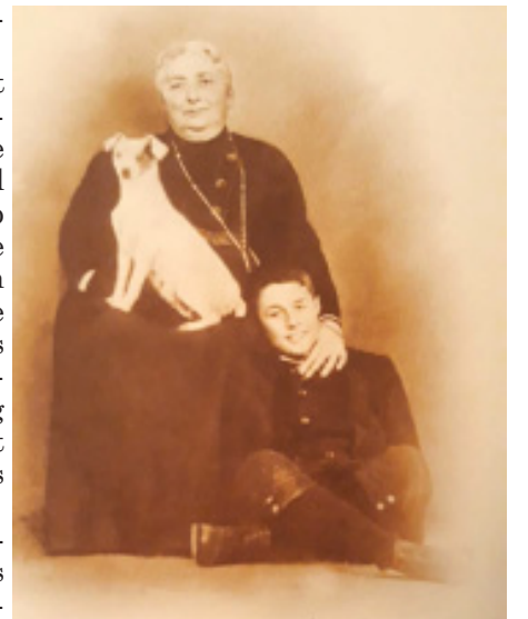
Salome Dadiani with her grandchild

Achille Murat is also remembered fondly and with warm feelings. He was known for his diligence, a high level of cul-