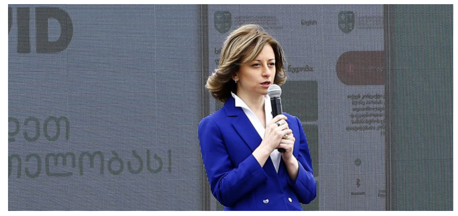
The STOP COVID application allows users to find out if they have been in contact with a person infected with COVID-19.

have been in close proximity to each other. Information about the interaction between the users of the application - the date of contact, cases of a certain duration (more than 15 minutes) and distance (less than 2 meters), encrypted, stored locally, in the application of both users. If a person is confirmed to have COVID-19, those who have been in contact with s/he in the last few days will receive a warning, an instruction - to remain in self-isolation and to apply to the relevant authorities immediately.