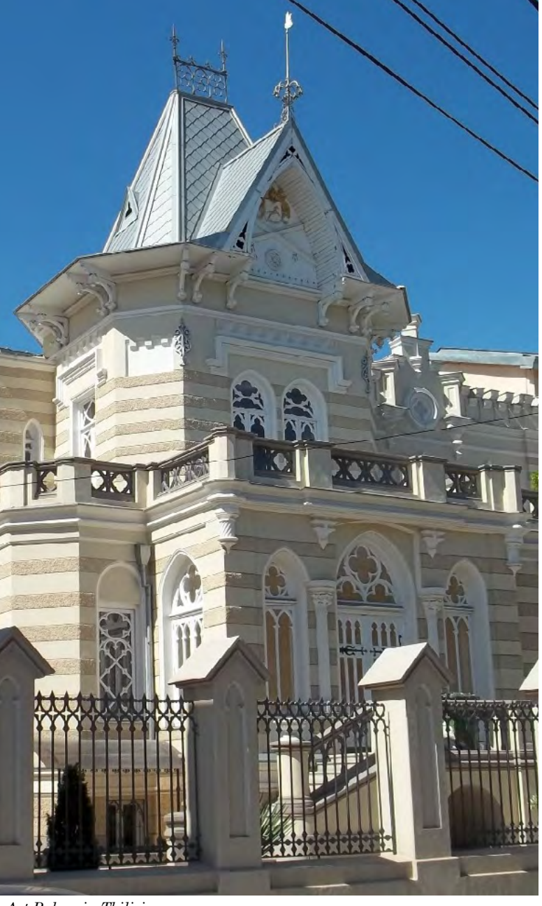
Art Palace in Tbilisi