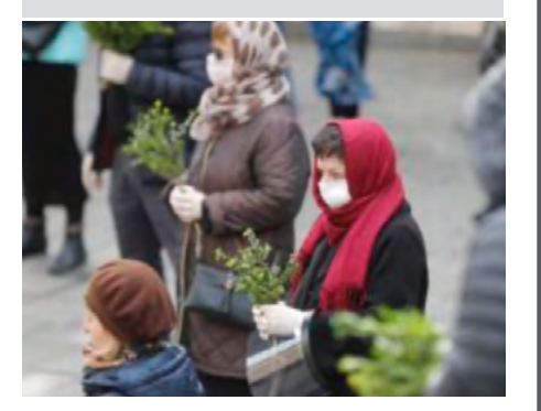
FULL STORY ON Page 2