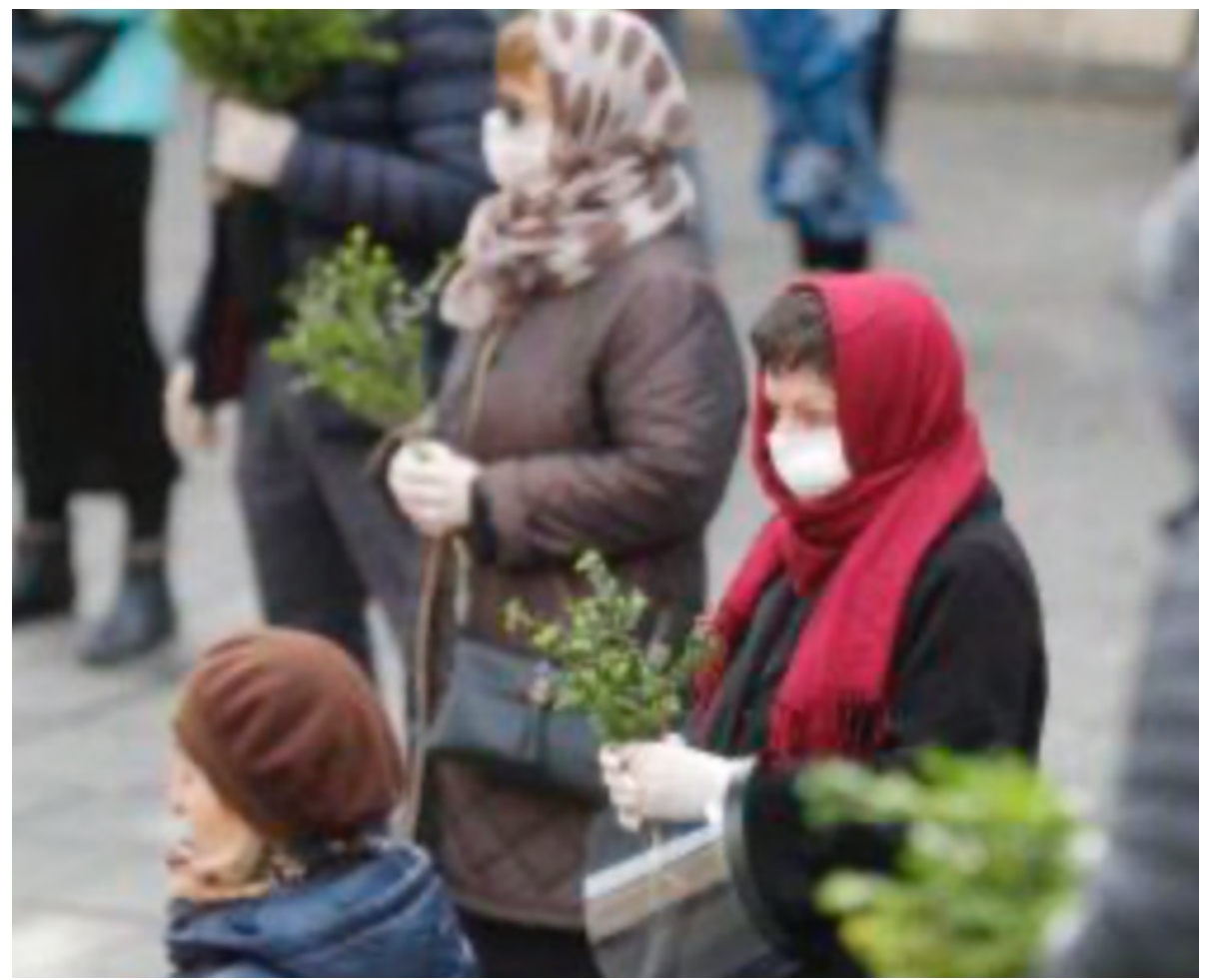
Easter to be celebrated despite the risk of spreading the virus.

Numerous countries that have been hit hard by the pandemic have reported common stories when social, cultural, or