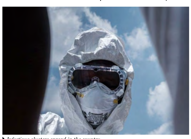
Infectious clusters spread in the country.

religious gatherings became one source of infection for hundreds of people. Such clusters play a key role in the global spread of the virus.