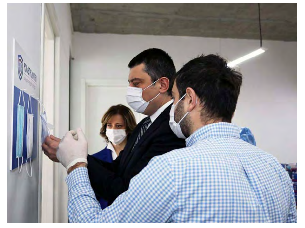
▶ High-quality, three-layer medical masks are certified by the National Center for Disease Control and are fully compliant with international standards