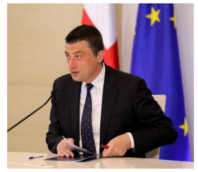
The prime minister stated that everyone must follow the recommendations provided by epidemiologists.

data, as of now, there are 695 reported cases of the virus in the country. Out of this, 12 have passed away, while 425 have recovered. Around the world, however, the number of the reported cases of the virus is still growing; there are more than 4,7 million reported cases.