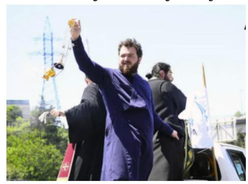
With the blessing of the Catholicos-Patriarch, members of the church were going around the city and blessing the population in Tbilisi.