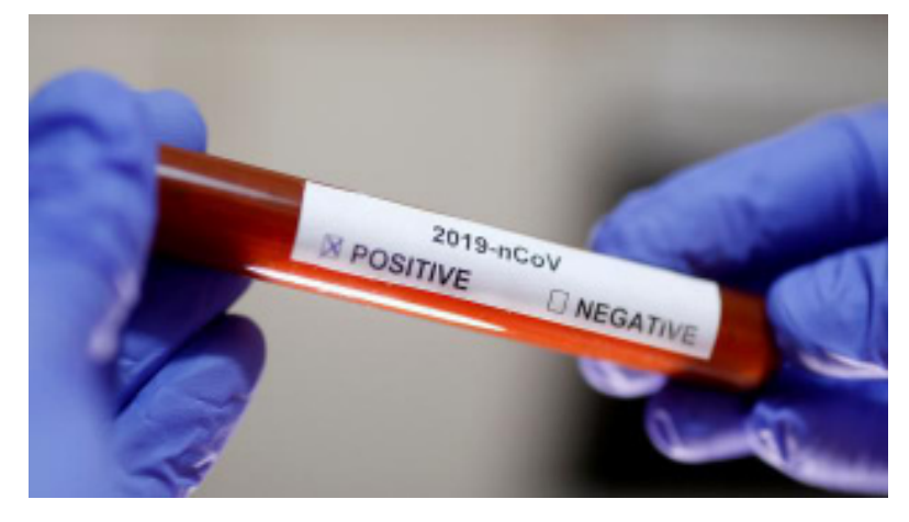
The novel coronavirus has spread worldwide very quickly