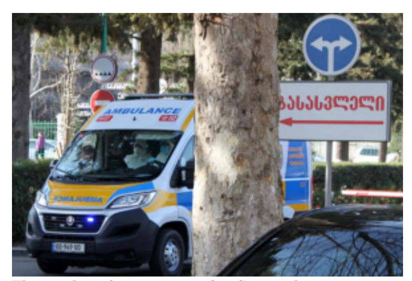
The number of cases reported in Georgia has succeeded 695.