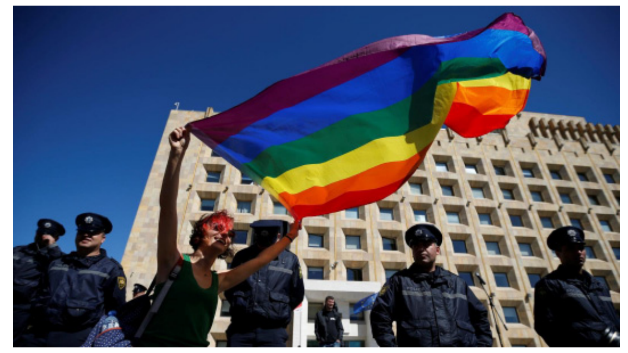
Tbilisi Pride organised an international online demonstration against homophobia, transphobia and biphobia yesterday.