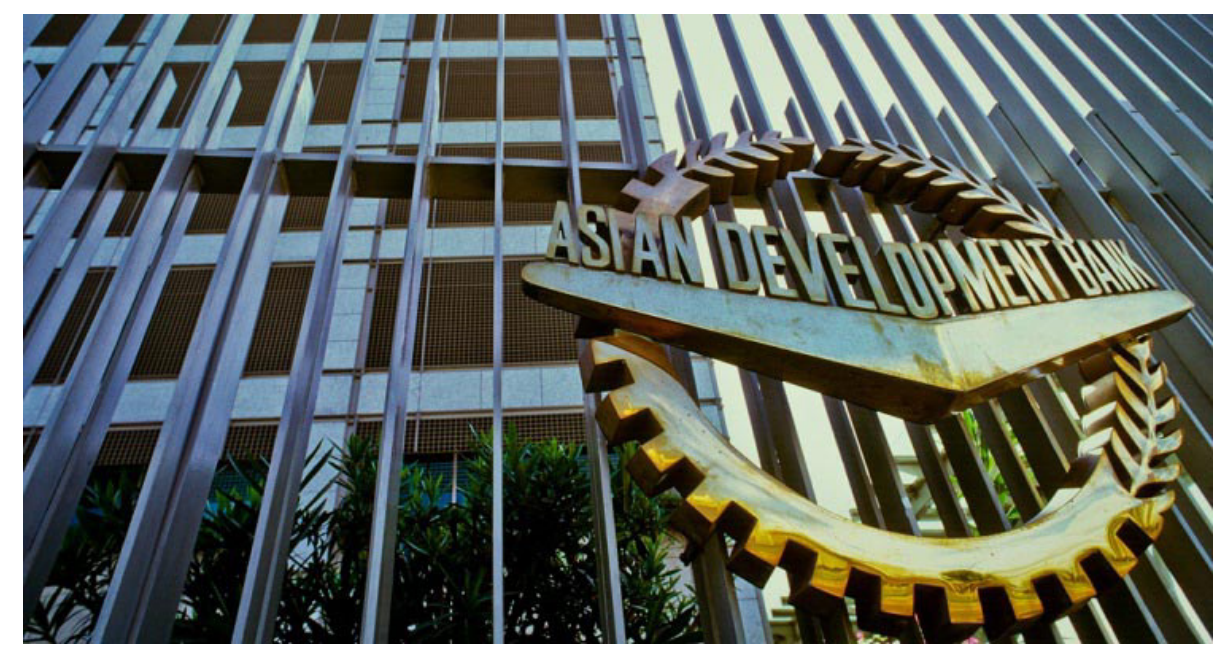
The global economy could suffer between $5.8 trillion and $8.8 trillion in lossesequivalent to 6.4% to 9.7% of global gross domestic product

he global economy could suffer between $5.8 trillion and $8.8 trillion in losses—equivalent to 6.4% to 9.7% of global gross domestic product (GDP) as a result of the novel coronavirus disease (COVID-19) pandemic, says a new report released by the Asian Development Bank (ADB) today.