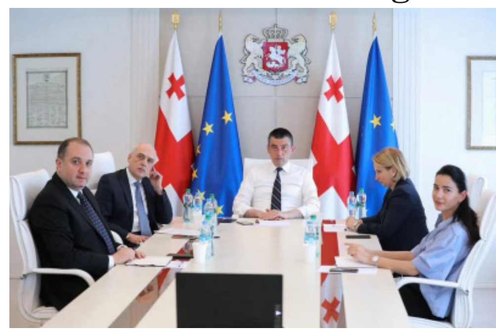
Government strengthening the country's name all around the world