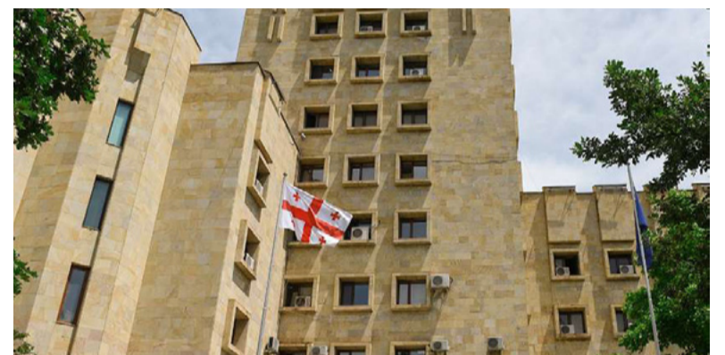
► Georgian Chief Prosecutor's Office