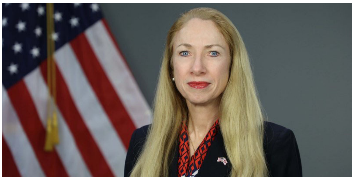
US Ambassador to Georgia talked about the importance of freedom and independence for American and Georgia people

“For almost three decades, the US has stood by Georgia’s side. Together, we have overcome many challenges, marked important benchmarks, and celebrated joint accomplishments. Today, the world faces the challenge of our lifetime and as always, in the face of this crisis,