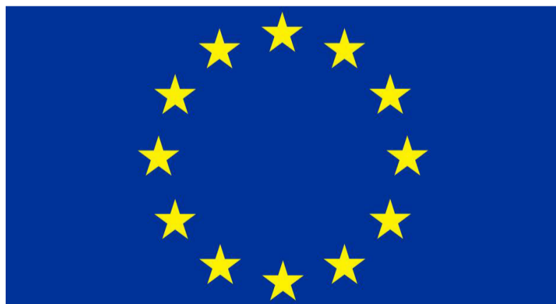
According to Gakharia, the main goal of the country is to become closer to the EU and NATO

as possible to the European standard in the coming years,” said Gakharia.