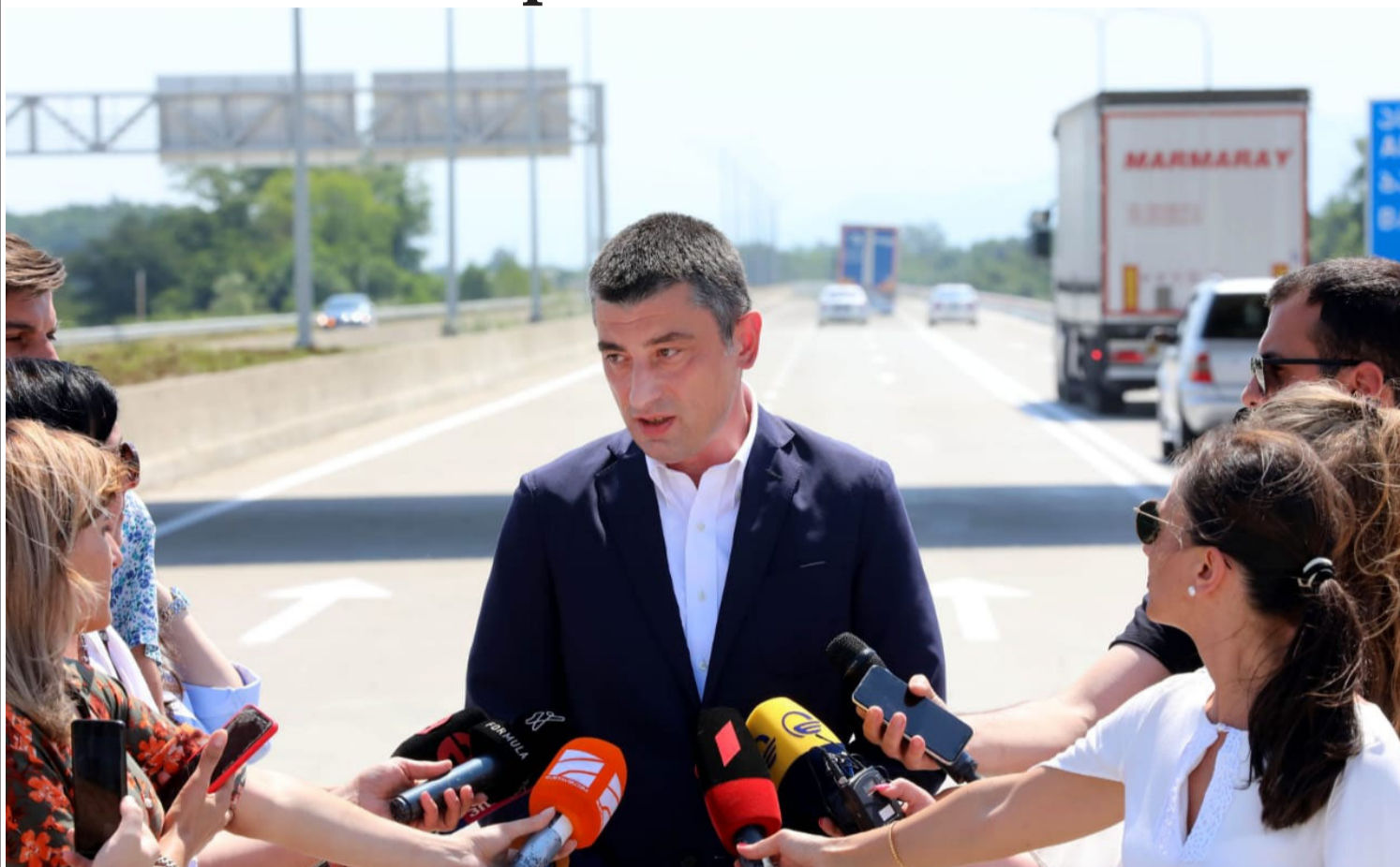
Gakharia talked about the electoral system