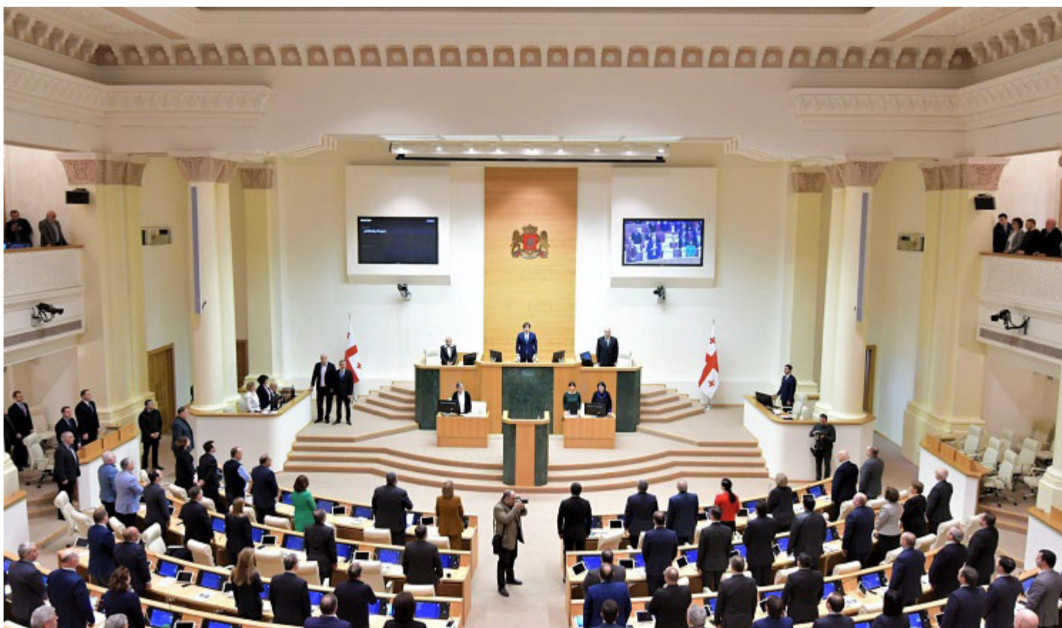
The new electoral system was adopted in the Parliament last week

He also said that the parliamentary republic and the proportional electoral system are among the highest characteristics of modern democracy. According to him, the main goal is for Georgia to become a full-fledged member of the European Union and NATO, for which the country will have to carry out many reforms and a great deal of work.