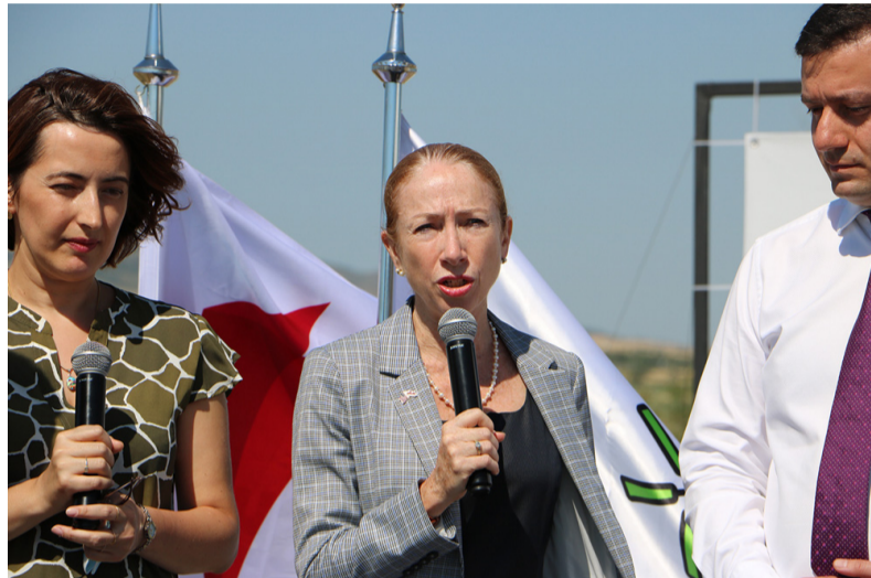
U.S. Ambassador Kelly Degnan at “Kombucha Brewers Georgia” Facility groundbreaking in ABL Karapila village of the Kaspi Municipality.

Start-up Georgia and USAID/ Zrda cooperate and invest in innovative projects that are expected to provide tangible development results to ABL communities across Georgia. Growth and development of MSMEs in the ABL communities will ultimately help to build self-reliant communities that will eventually serve as a model for the rest of Georgia as well as an opportunity to build bridges with residents living in the occupied territories.