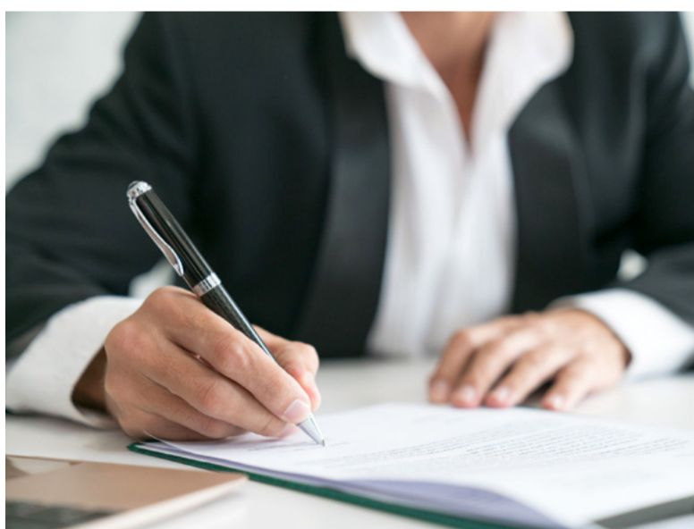
► the statement was signed by the following NGOs: Transparency International-Georgia (TI), Institute for Development of Freedom of Information( IDFI), Civil society Institute(CSI) and Green Alternative.

"Among others, financial assistance for Georgia in the amount of $132,025,000 is mentioned in the document. However, the withholding of funds is also indicated in the bill, according to which, 15% of financial assis-