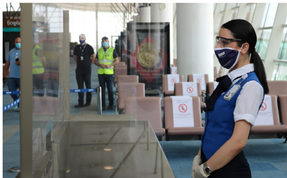
► Georgian Government announced it would open the borders for international tourism starting from July 1st, however the closure of the national borders was extended, with the regular flights being suspended until further notice.

Yesterday, 5 new cases of coronavirus were confirmed in Georgia. The total number has increased to 963. 3 more patients were cured of coronavirus. A total of 841 have recovered. As of the morning of July 8th, 107 patients are being treated. 3903 is in quarantine mode and 202 under hospital supervision.