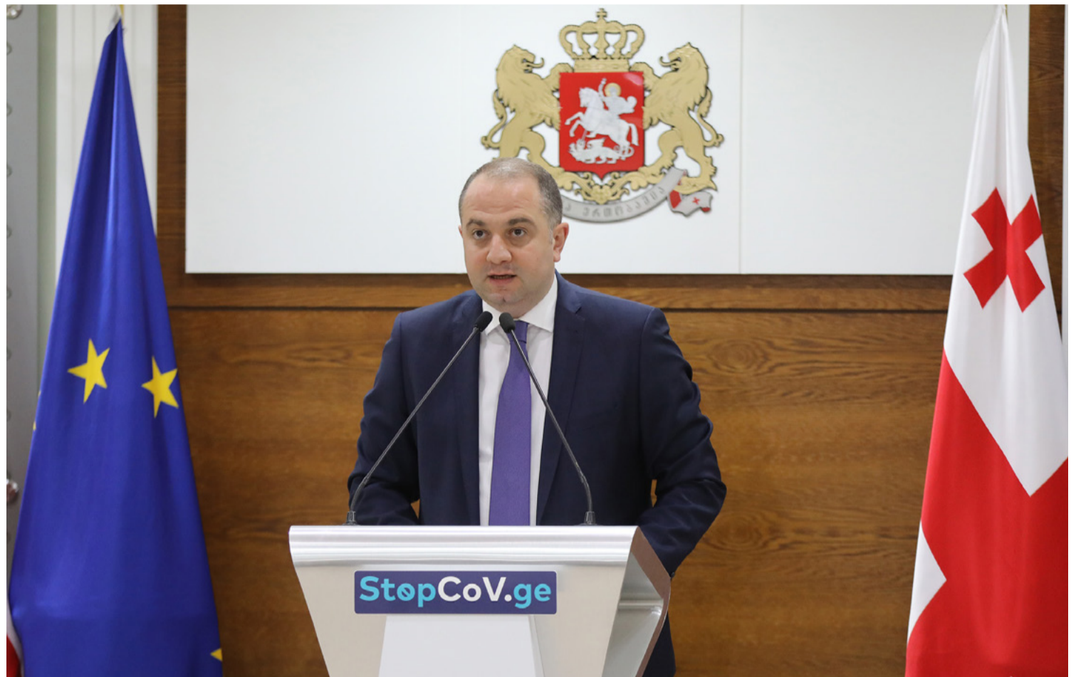
► According to the government, work with EU countries that have decided to open the border continues with the relevant procedures.

As for the rest of the countries, the Council took into account that several countries have opened their borders to states that are not on the list of safe countries defined by the EU.