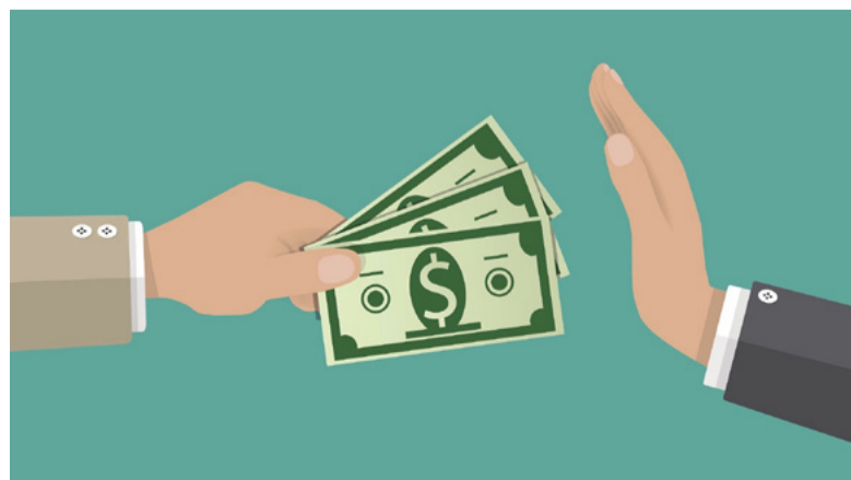
► NGOs point out that, in the last few years there have not been any significant reforms for fighting against corruption in Georgia and the progress in this direction is no longer observed.

According to the corruption perception index by Transparency International, in 2019 amongst 180 countries, Georgia was ranked 44th with a score of 56, which is a worsened index compared to last year. According to the corruption perception index, limited separation of powers, abuse of state