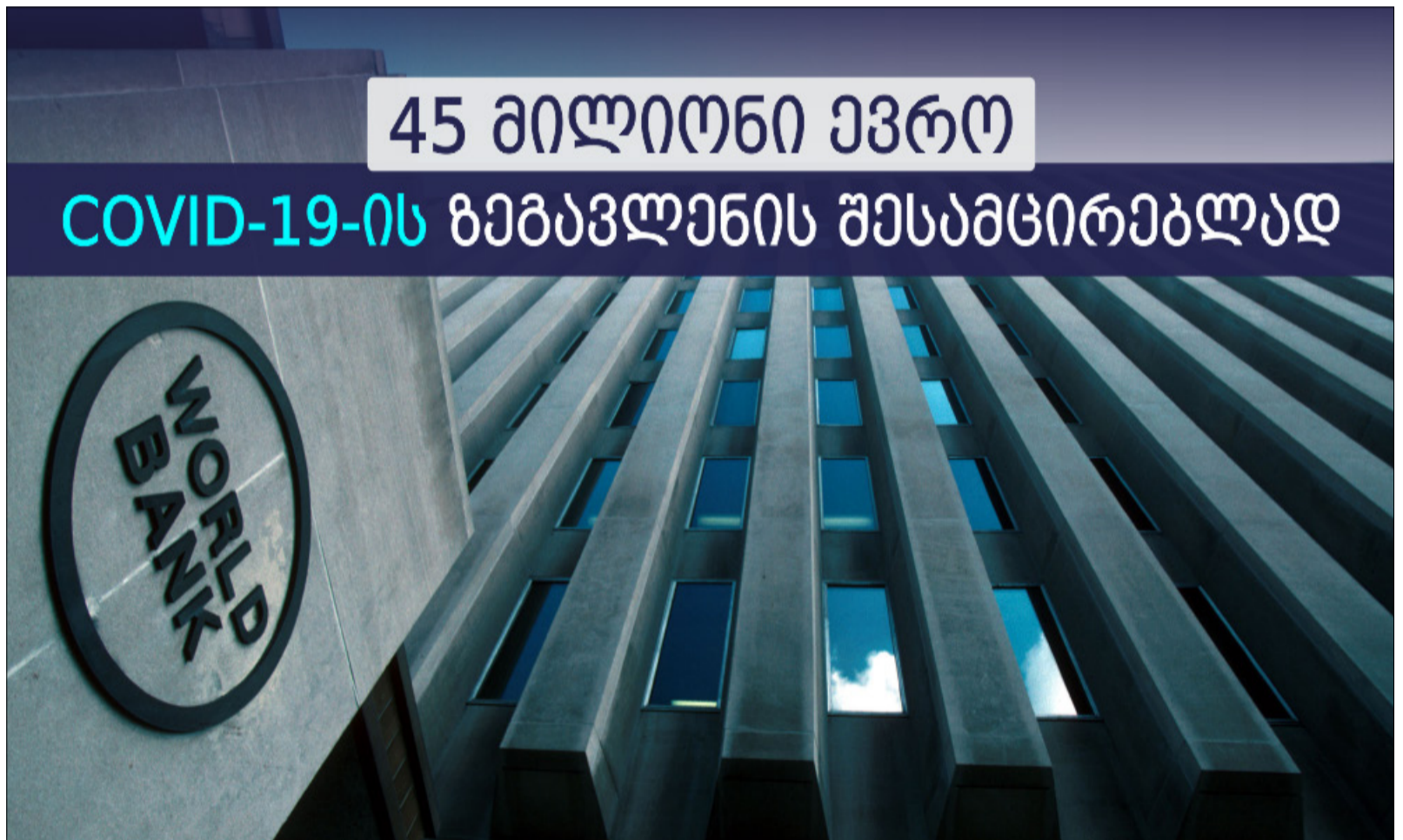
► Over the next 15 months, the World Bank will allocate about $ 160 billion to help more than 100 countries to protect poor and vulnerable families, support companies and rebuild their economies.

The third tranche will focus on helping micro, small and medium-sized enterprises and maintaining jobs that have been negatively affected by the COVID-19 pandemic.