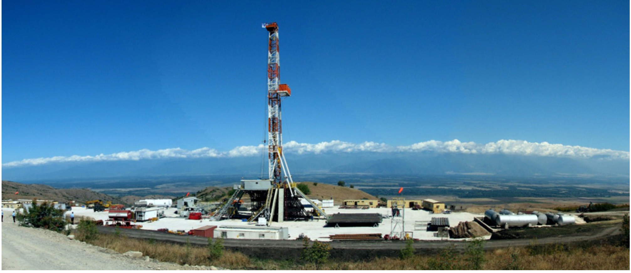
Frontors Resources an international oil and gas exploration and production company

On July 24<sup>th</sup>, Frontera Resources, an international oil and gas exploration and production company made a statement, where it was noted that the government of Georgia runs disinformation campaigns. The company accused the government of libel as well as deliberate pressure.