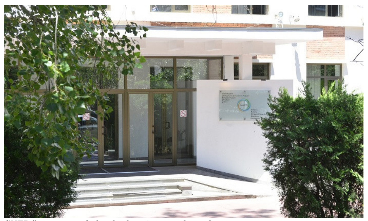
GNERC approves wholesale electricity market rules.