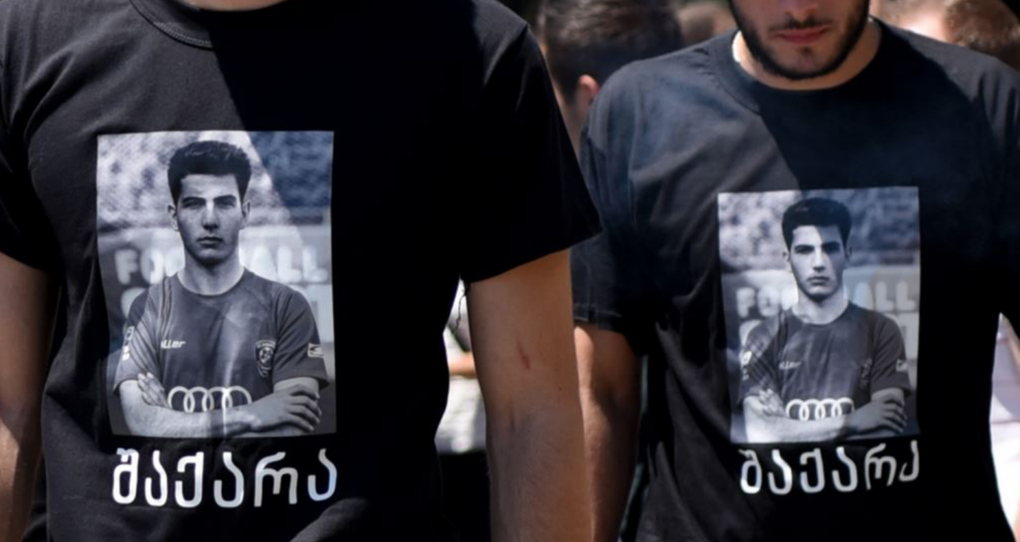
A total of 17 people have been arrested in Shakarashvili's case. The cases of 6 juveniles are separated, as the Juvenile Justice Code requires expedited trial, while the guilt of the remaining 11 persons is considered by the court in a separate trial.