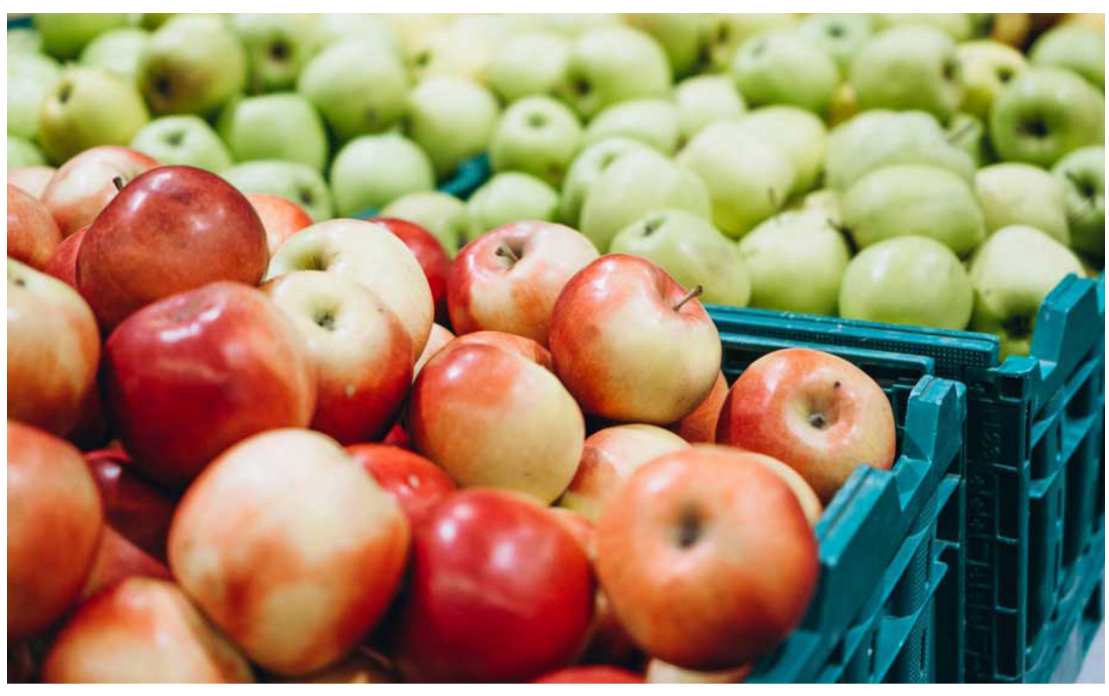
Ministry of Agriculture Releases Information on Non-Standard Apple Procurement Subsidy Project.

In total, in the second quarter of 2020, imports of goods fell by 32.8% year on year. Imports from countries in the region are mostly reduced from Turkey. The decline in imports continued from the US and China. In contrast, imports from the region are mostly increased due to the import of precious metals