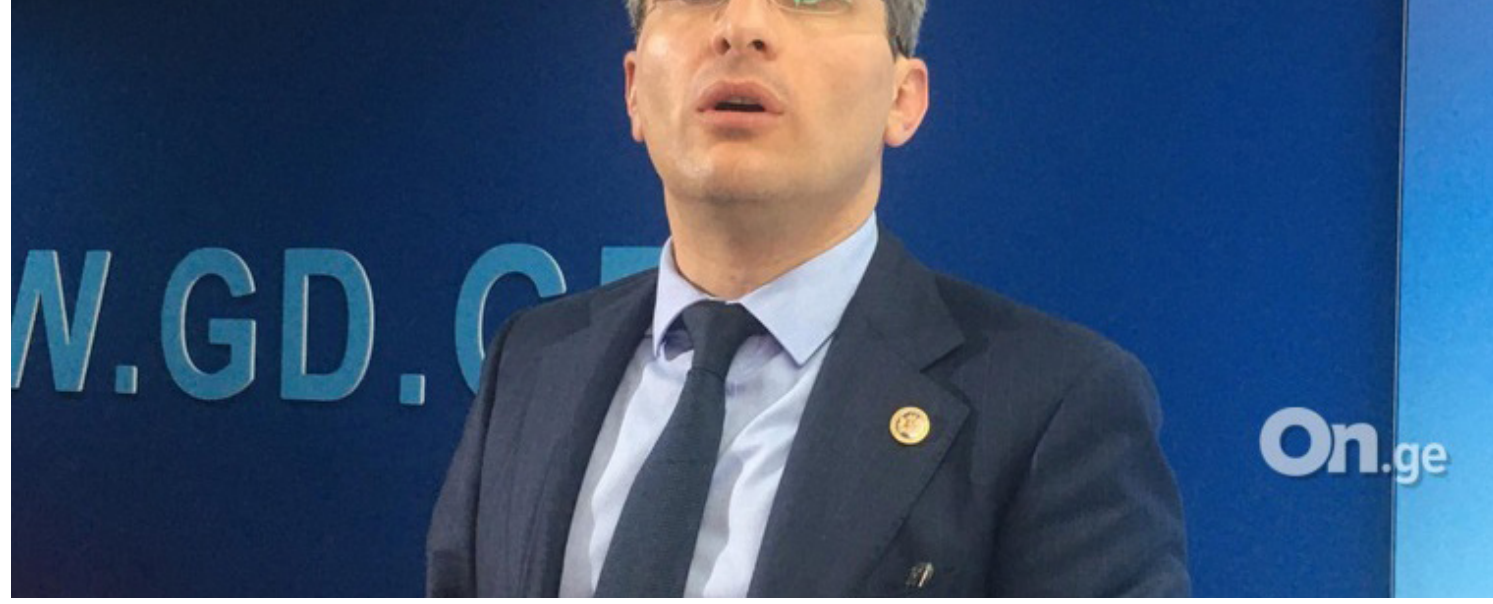
Mdinaradze says Rustavi 2 poll is closest to reality.

According to a public opinion poll commissioned by Rustavi 2, conducted by the British company Survation, 81% positively assess the army and 75%- the church. Police are in the third position.