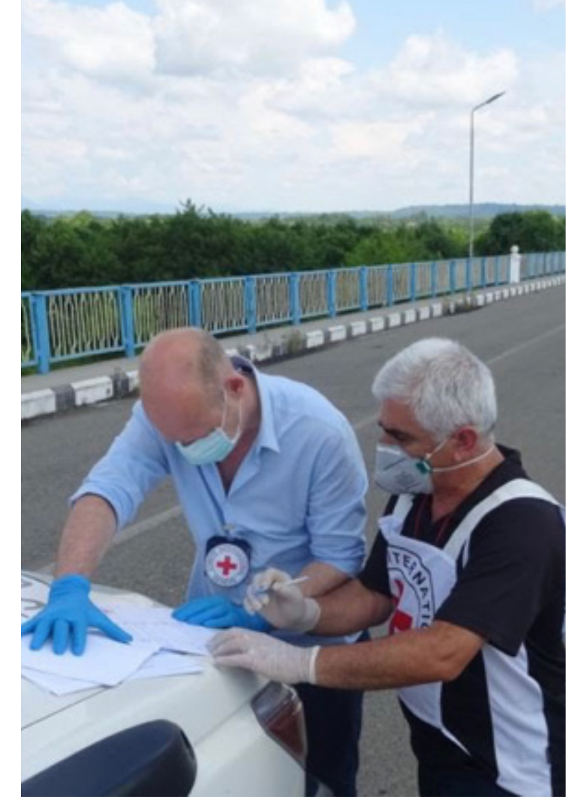
> The Red Cross-platform is humanitarian only and acts on behalf of the families of the missing.