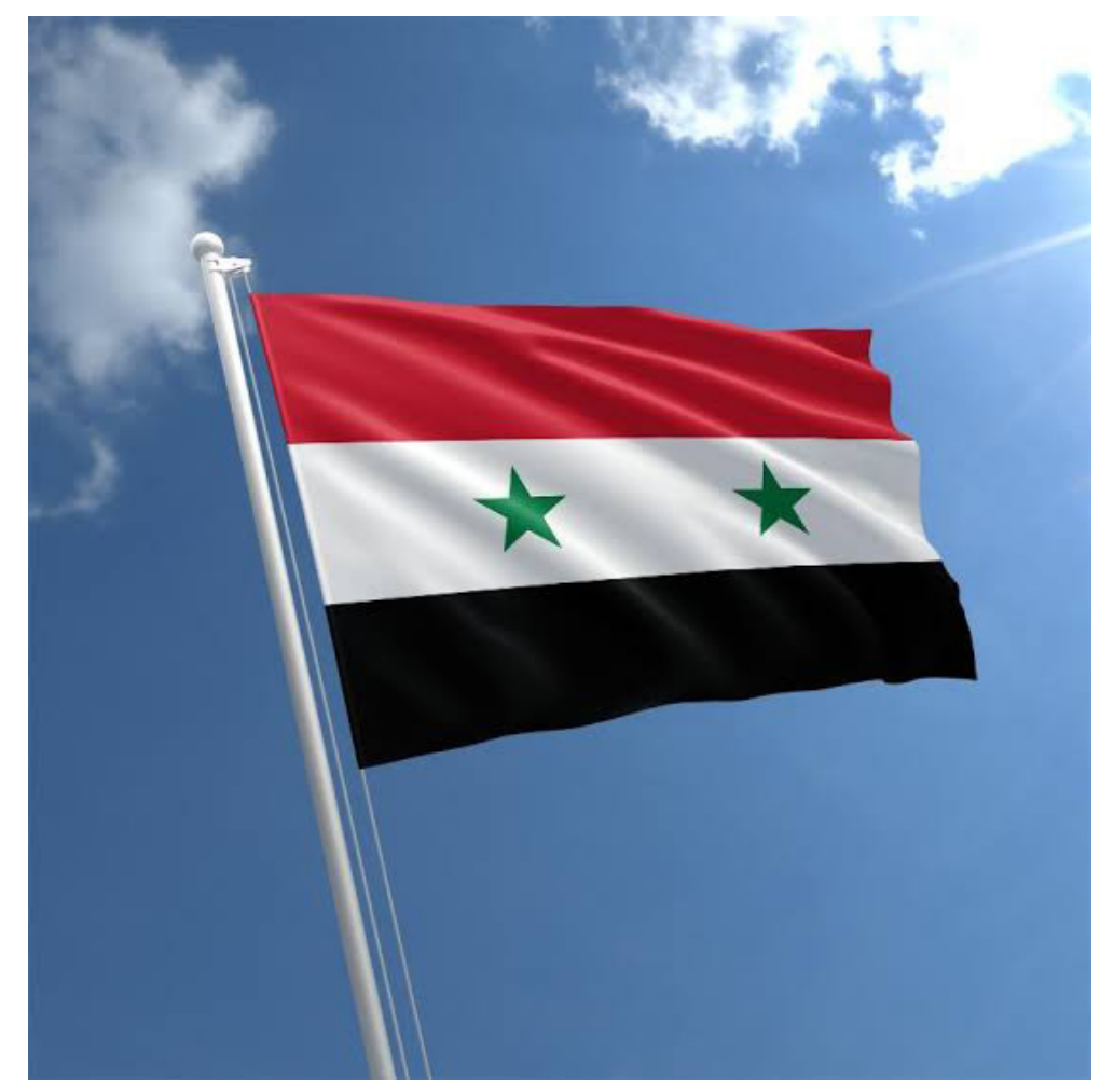
A delegation of the de facto government of Abkhazia occupied by Russia is in Syria.

"The entire international community, leading European countries, the United States, and international