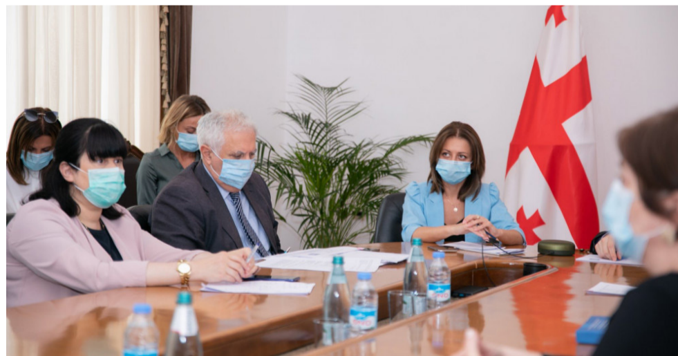
► According to the PM Gakharia, the coronavirus infection rate will exceed 1,000 in the coming days and the main strategy of the government will be point restrictions.

Also, according to the decision of the Government of Georgia, part of the restrictions have been lifted due to the stabilization of the situation in Adjara, and some will continue. In particular, public transport, including intercity transport,