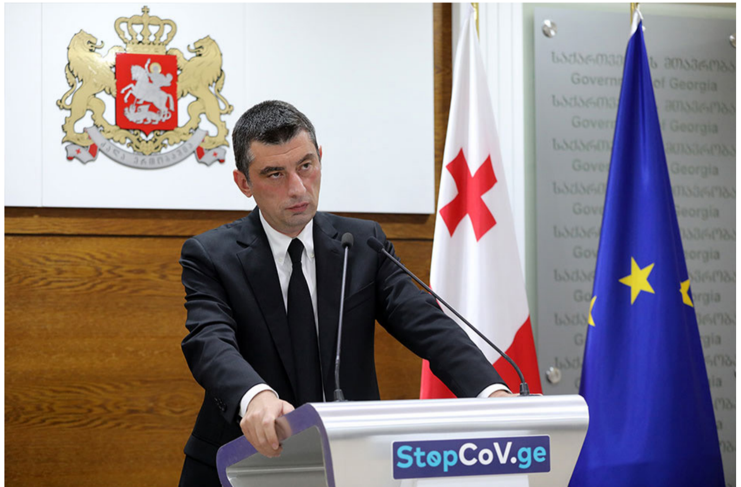
► The restaurants and entertainment facilities in Georgia's capital Tbilisi, and in the western Imereti region will be banned from operating past 22:00.