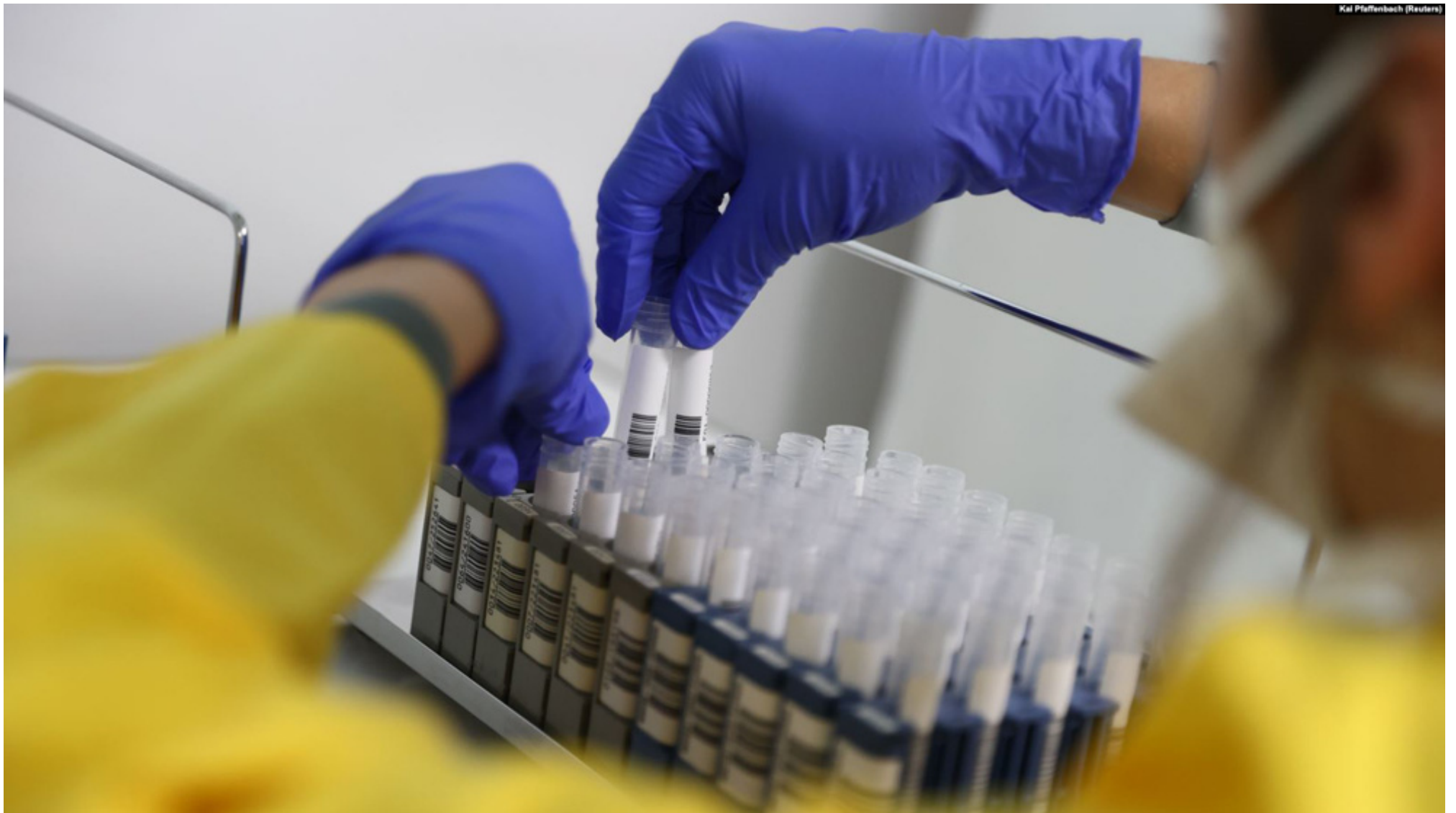
Over the weekend, 12 people passed away due to the complications of Coronavirus