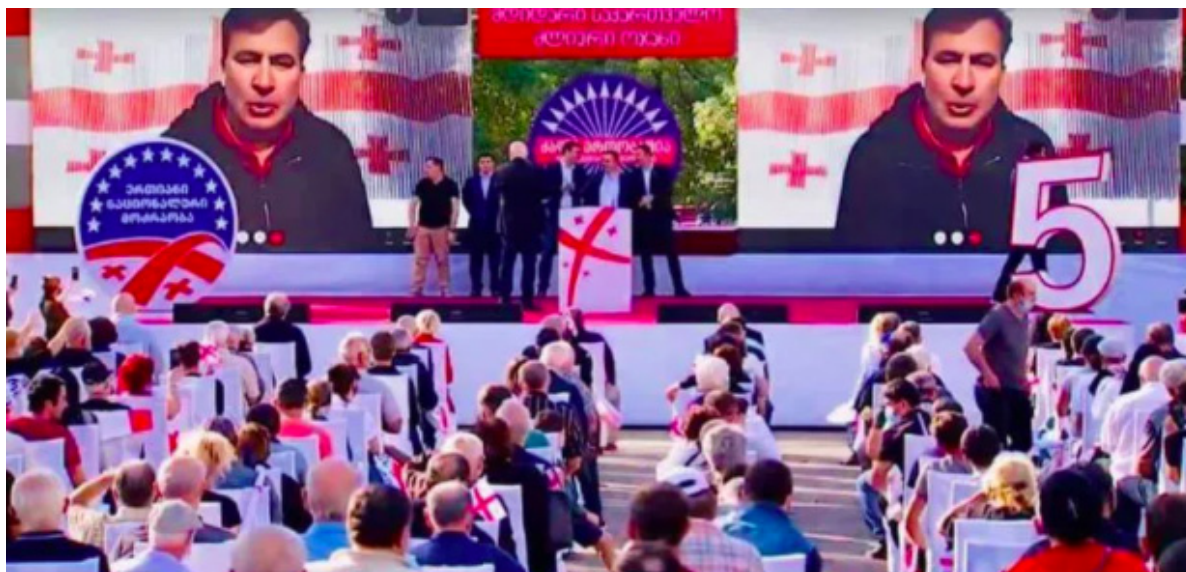
Mikheil Saakashvili addressed Georgians, said the government artificially spread Coronavirus in Batumi

The Mayor of Tbilisi Kakha Kaladze commented on the UNM's rally in Batumi and said that Georgia is fighting against two viruses, 'Coronavirus and the UNM.' Also, Ombudsperson of Georgia Nino Lomjaria said that when it comes to the critical situation like the country is in today, it is 'extreme irresponsibility' to gather such a large number of people for a rally,