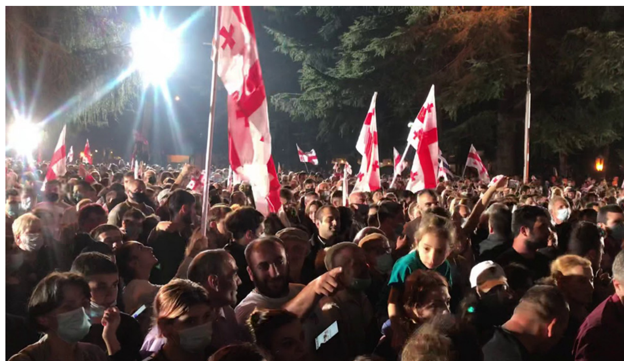
The rally that was attended by thousands of people, was followed by sharp criticism from society and other political leaders