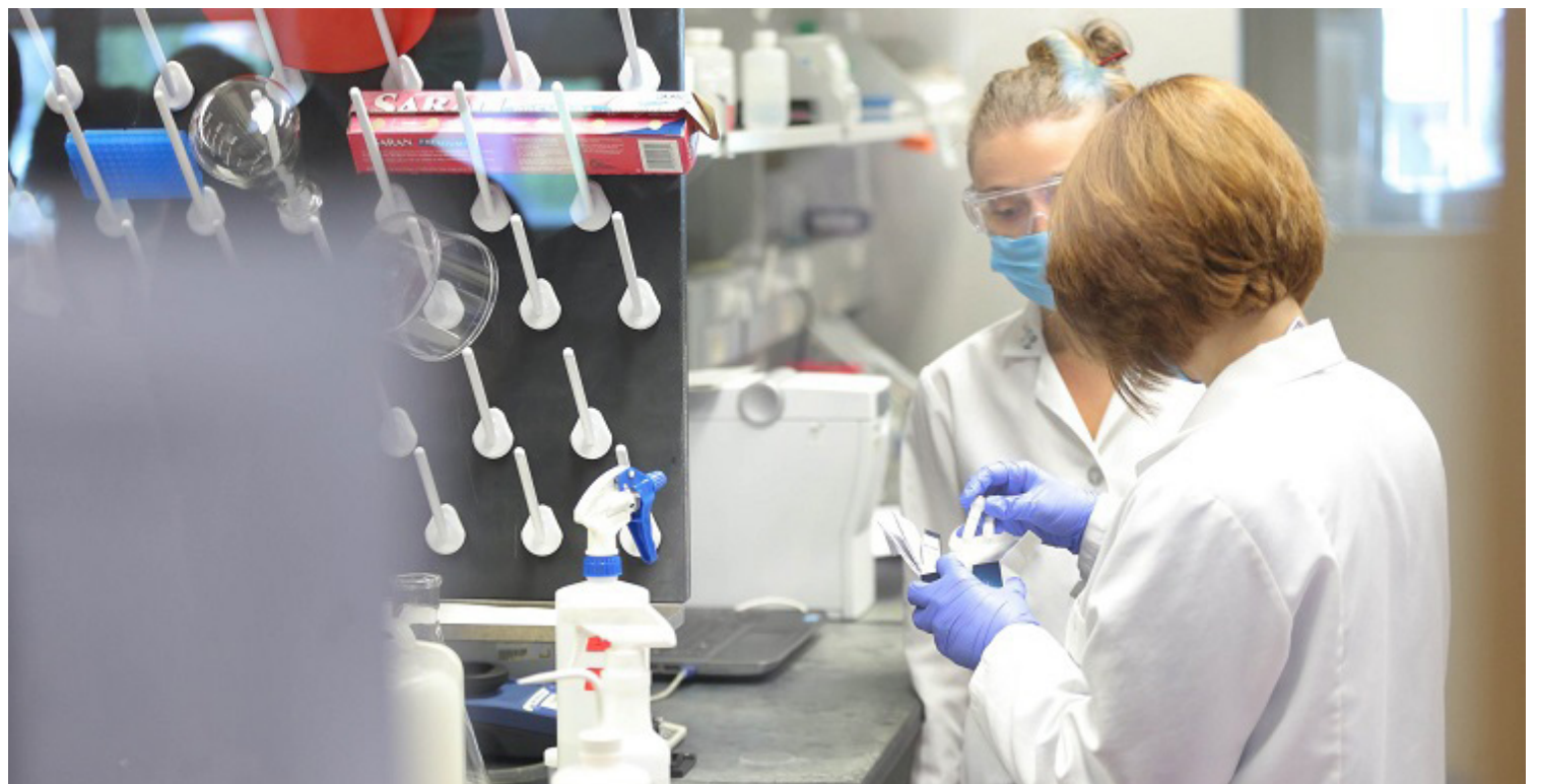
There are total of 9281 active cases in Georgia