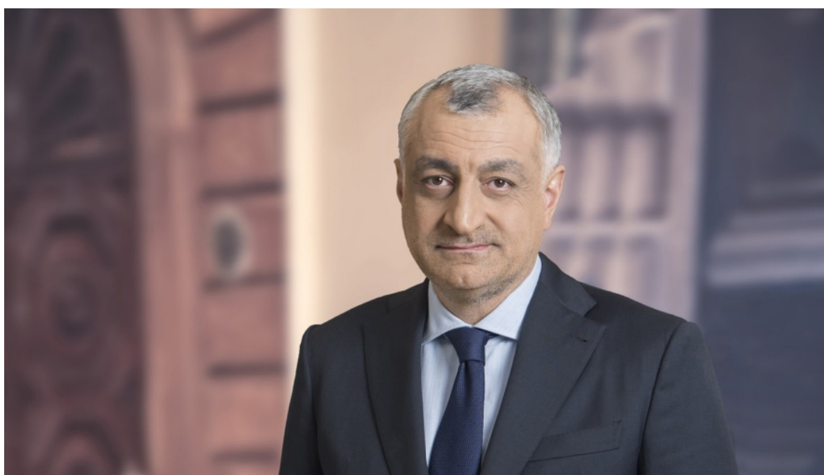
Khazaradze tested positive for Covid-19.

In total, there have been more than 17477 cases reported in the country, with 8060 recoveries and 136 deaths. As of Sunday evening, there are 9281 active cases in the country.