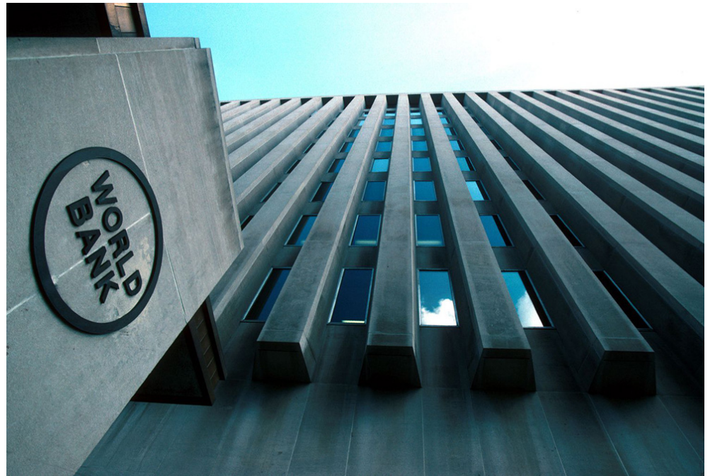
According to the forecast of the World Bank, in 2021, Georgia will have 4% economic growth

IMF claims the country's economy will shrink by 5%