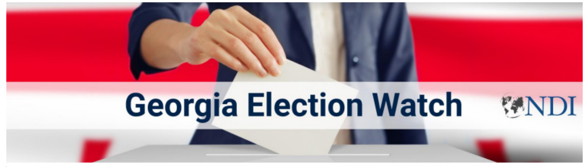
• "Georgia's media environment is among the freest and most diverse in the region, but it is highly polarized, potentially impacting citizens' ability to make informed electoral choices."