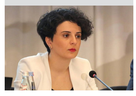
FULL STORY ON Page 2

Headline: Head of Government Administration shares decisions made at inter-agency coordination council