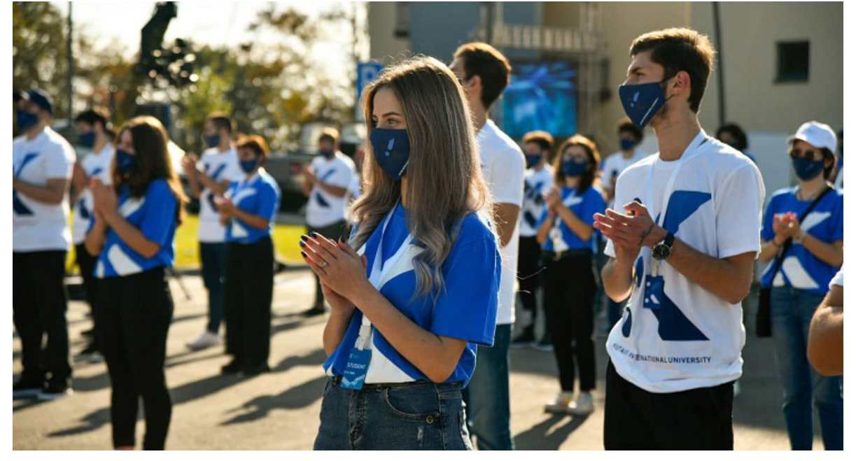
• Only 245 out of 1112 applicants were accepted by Kutaisi International University this year.

According to the ranking, the most popular program of KIU, where the majority of students have been enrolled this year in Computer Science, which is then followed by a Management program and Mathematics.