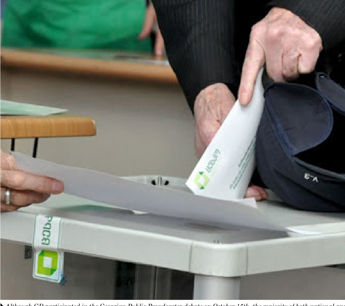
Although GD participated in the Georgian Public Broadcaster debate on October 15th, the majority of both national and regional outlets, particularly those viewed as opposition-leaning or critical of the government, report that the ruling party has avoided or ignored their programs.

The bulletin also notes that in recent weeks, traditional media outlets have been holding national and local debates with the participation of political parties, although many media outlets have stated that it was difficult to secure the Georgian Dream's participation in the debate. The criticism was also expressed towards the Georgian National Communications Commission. In particular, it was said that the commission was politically biased and focused more on controlling the opposition media. NDI's Second Pre-Election Assessment Bulletin states that, according to a report by the International Society for Fair Elections and Democracy, Facebook was used by 17 political parties and 117 majoritarian candidates in the summer elec-