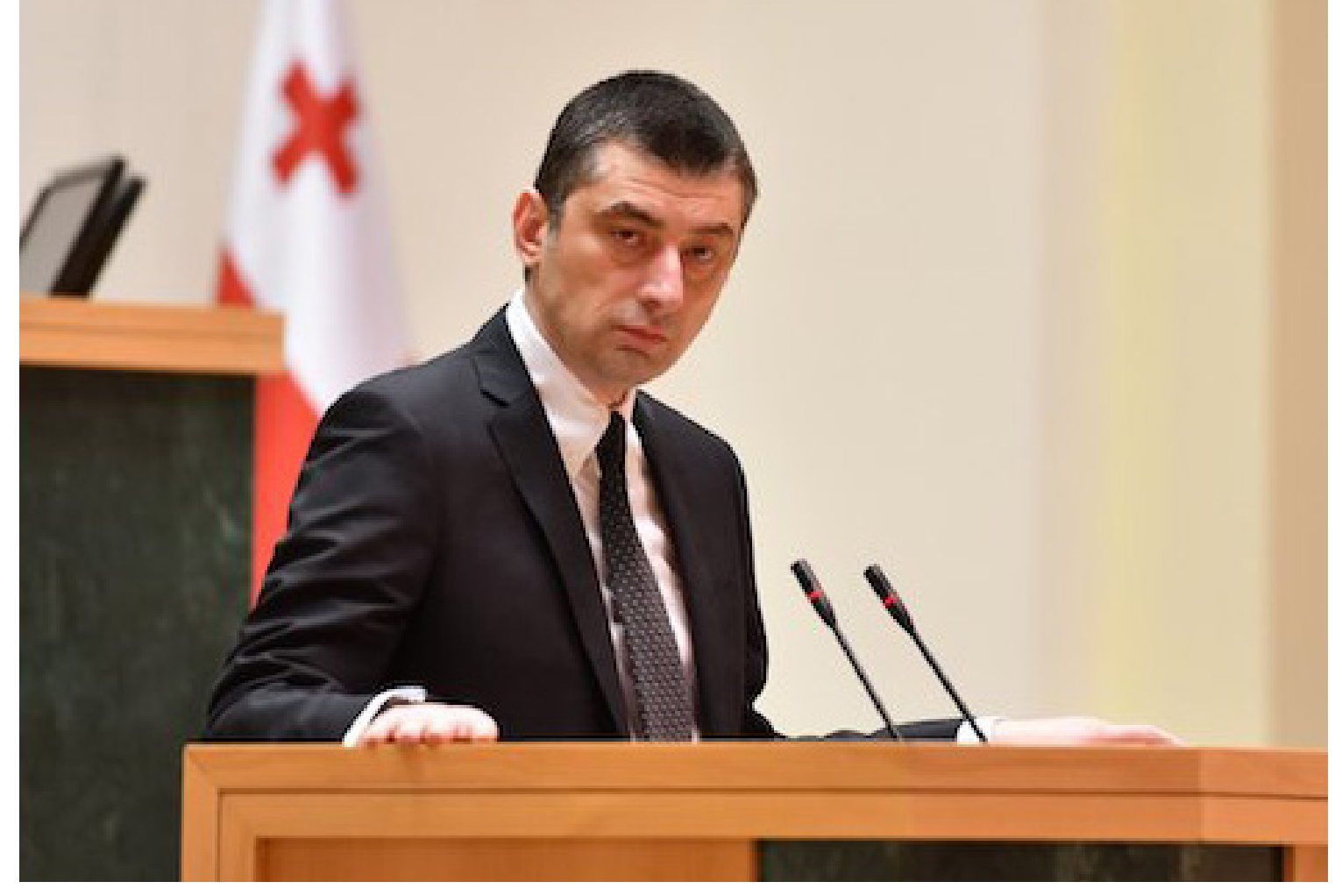
> The Prime Minister of Georgia Giorgi Gakharia was reappointed as the Prime Minister on December 24.