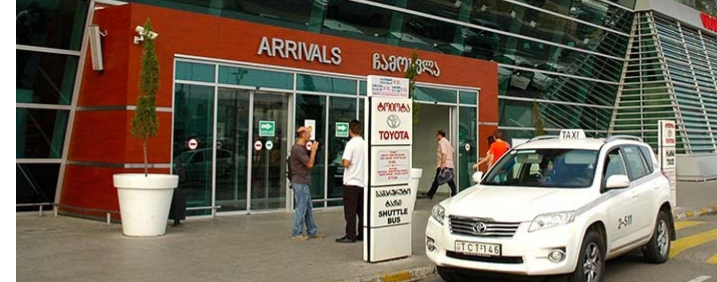
According to the new rule, Georgian Border Police will be checking several criteria before allowing a person into the Schengen area.