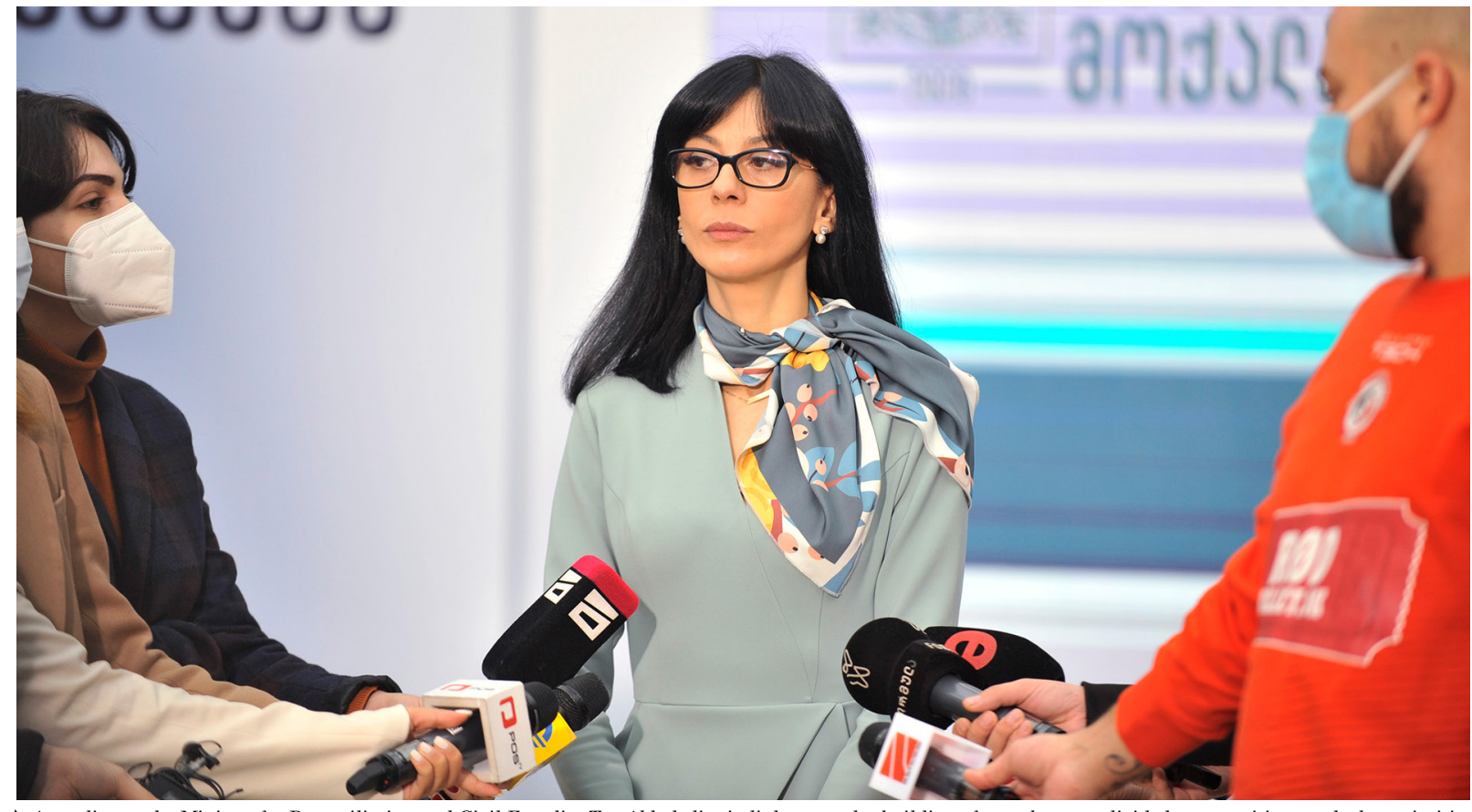
> According to the Minister for Reconciliation and Civil Equality Tea Akhvlediani, dialogue and rebuilding of trust between divided communities are the key priorities of reconciliation policy.

According to Akhvlediani, as soon as the pandemic started,