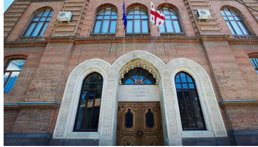
MFA once again said that Russia should fulfill the 2008 ceasefire agreement

Experts are saying that all of the steps taken by Russia are part of 'their game', trying to scare the people of Georgia and the government as well