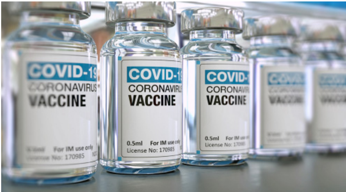
It is still unknown which vaccine will be used in Georgia

The Pfizer-BioNTech vaccine is used in the United States, the United Kingdom, Canada, and the European Union. It is also approved by the World Health Organization.