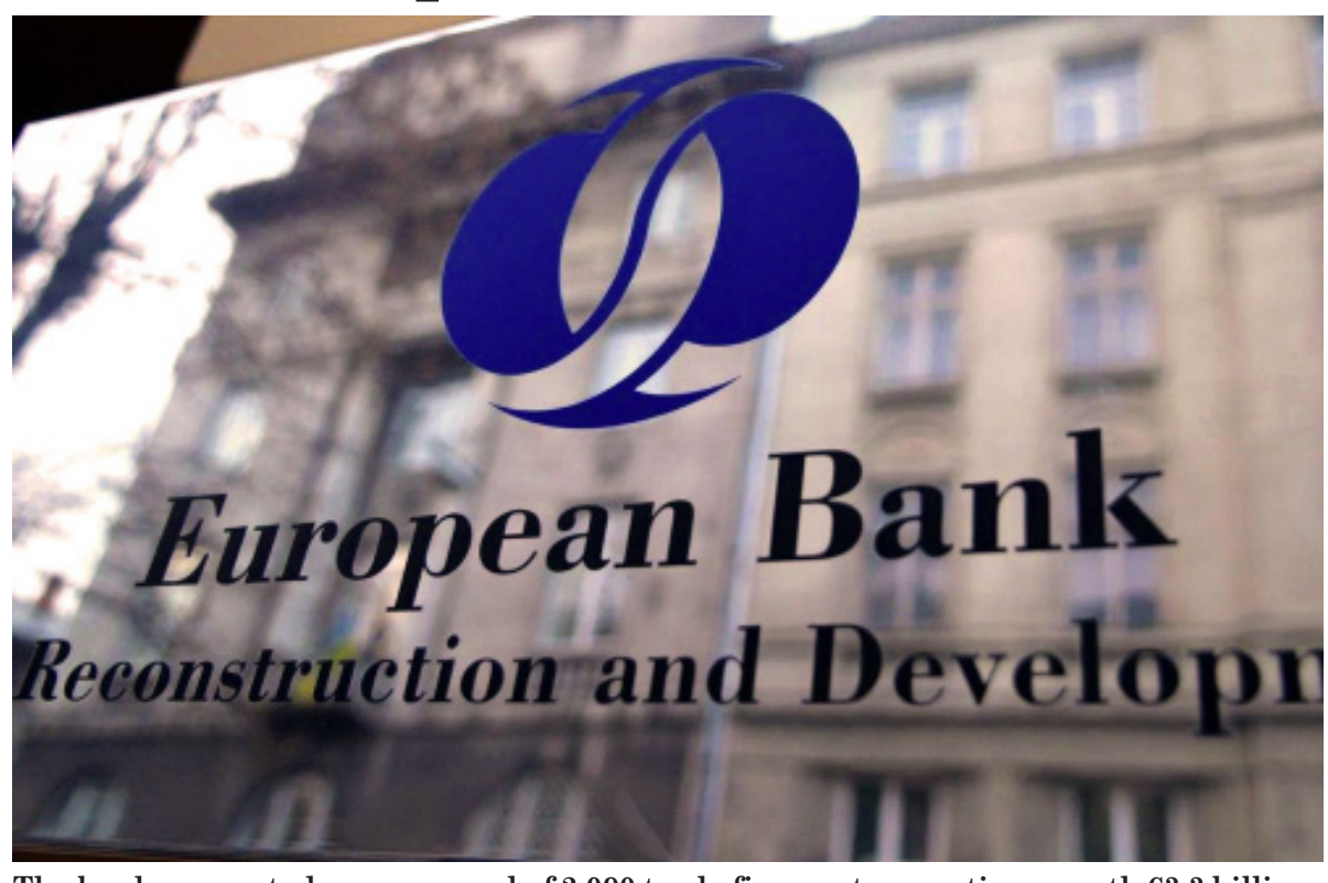
The bank supported a new record of 2,090 trade finance transactions worth &3.3 billion under its Trade Facilitation Programme

In Ukraine, the EBRD combined investment with policy engagement with a €450 million loan to the state road agency