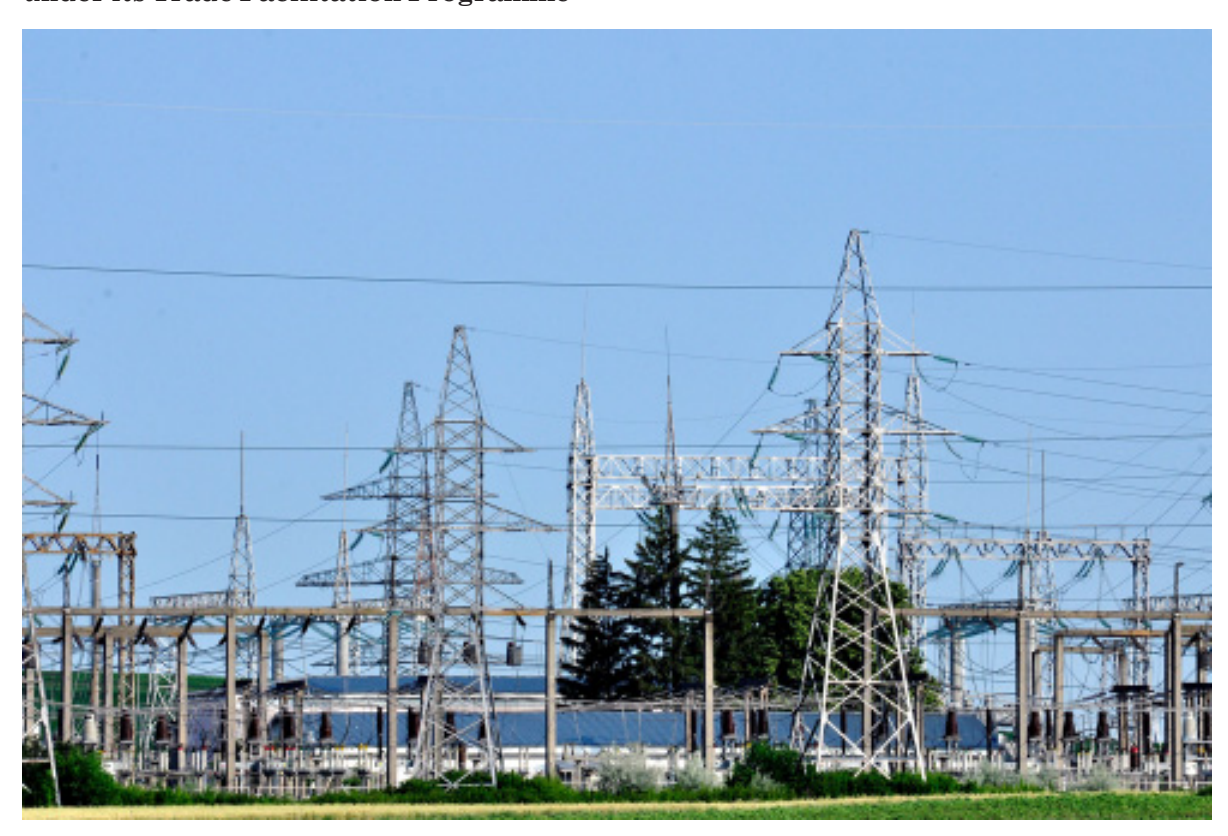
In the Caucasus, the Bank financed over US $ 400 million worth of investments in the energy sector

Ukravtodor, supporting the government in the development of national road infrastructure and the fight against corruption. The Bank's public-private partnership (PPP) advisory activities led to the commercial close of two port PPPs at Olvia and Kherson in Ukraine.