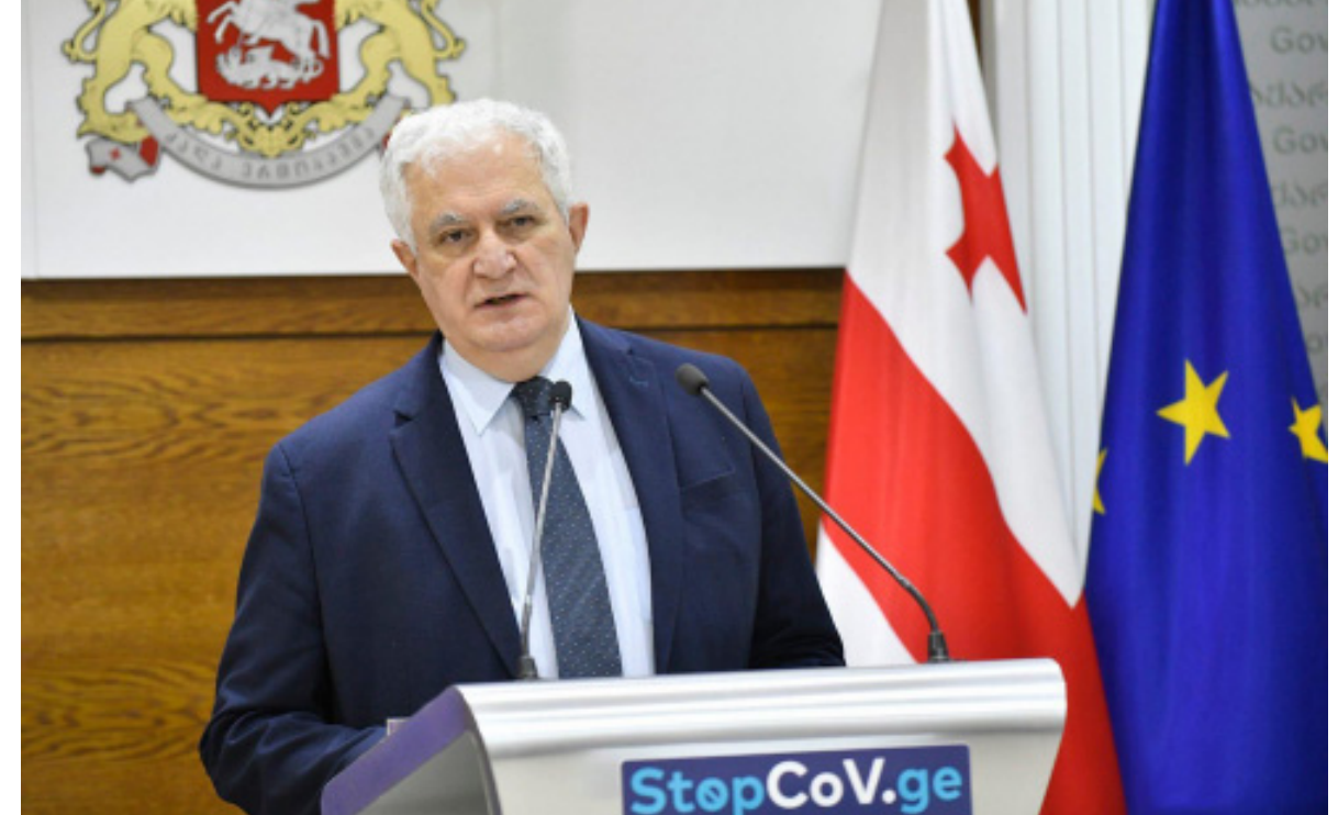
According to Gamkrelidze, about 60% of the population is planned to be vaccinated against coronavirus