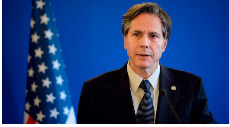
• "We need to revitalize our fundamental ties and alliances ... Together, we have better positions against the threats posed by Russia, China, Iran and North Korea, and in order to protect democracy and human rights."

Skeptical of NATO's open door policy and opposed to irritating Russia, the senator went on to say that if Georgia were to join the alliance, Russian occupation would trigger NATO Article 5 and send American troops to defend Georgia.