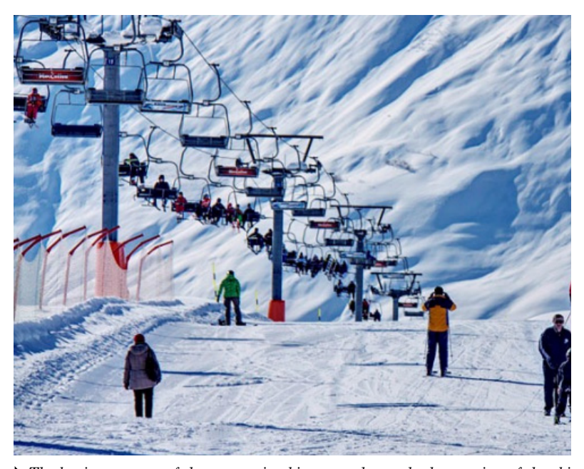
▶ The business sector of the mountain-ski resorts demands the opening of the ski lifts from February 1.