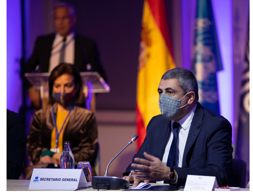
• "The UNWTO Executive Council has voted for Secretary-General Zurab Pololikashvili to lead UNWTO for four more years, with members backing his vision for the 'restart and rethink' of tourism," reads the statement published on Facebook by UNWTO.

The Prime Minister of Spain Pedro Sanchez, as well as the candidate for the UN Secretary-General for the UNWTO Zurab Pololikashvili, addressed the participants of the session. Ac-