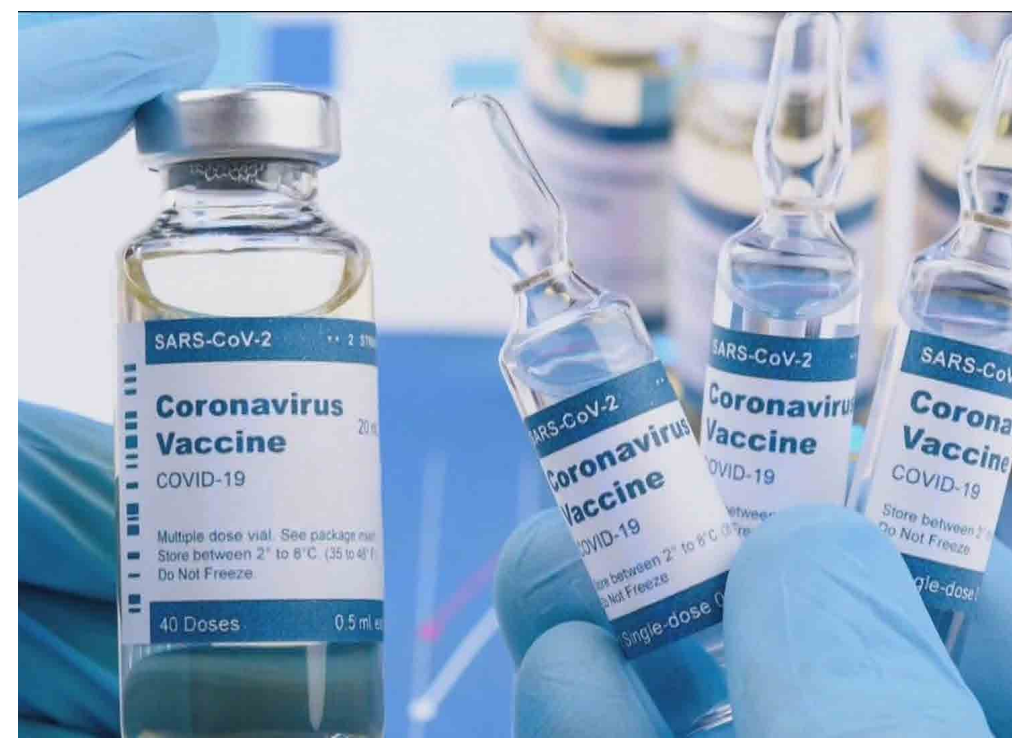
▶ The project will be implemented by the World Health Organization