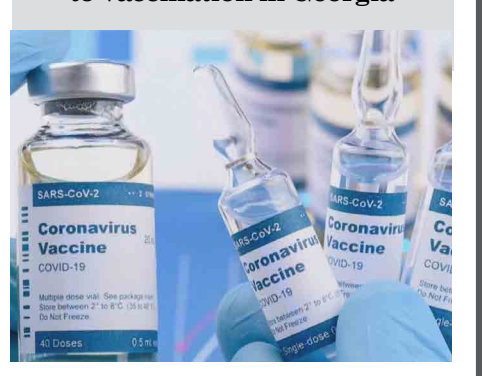
FULL STORY ON Page 2

EU to allocate €40 million to vaccination in Georgia