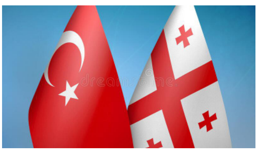
Agreement on Diagonal Cumulation was signed between Georgia, EU, and Turkey on March 20, 2018, and will be entering into force soon.