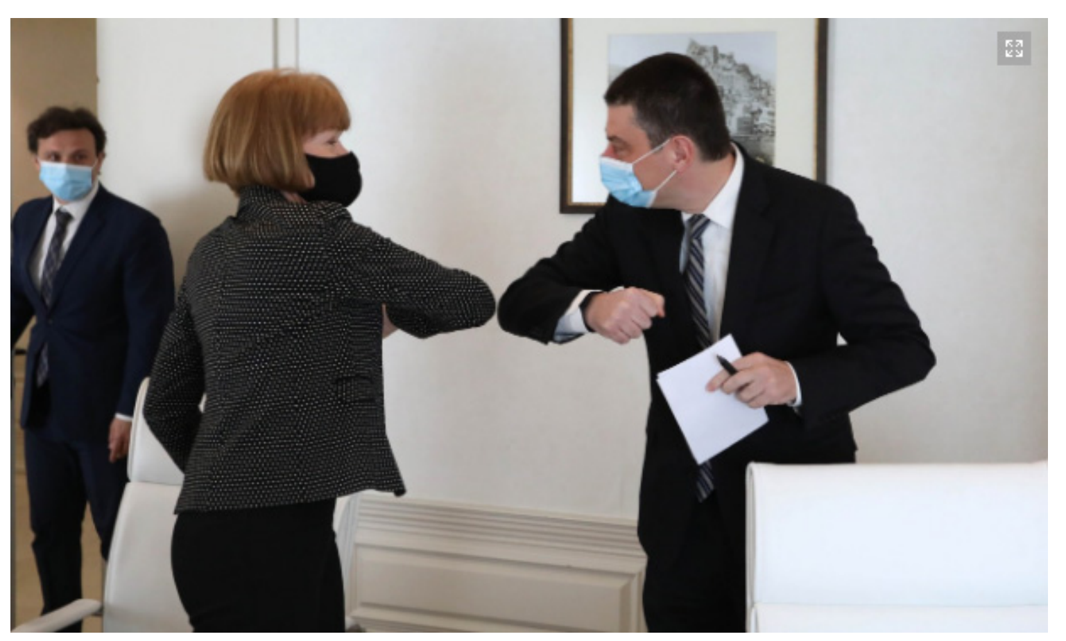
British Minister Morton and Georgian Prime Minister Giorgi Gakharia.

According to the press office of the government, the sides positively assessed the cooperation of Georgia and the UK in fields such as cybersecurity and the fight against hybrid threats. The focus was