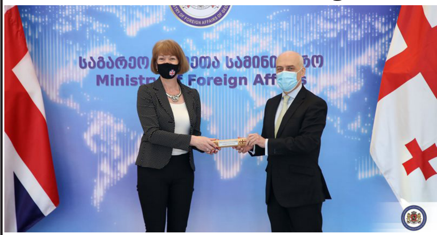
UK Minister for European Neighbourhood and the Americas Wendy Morton and Georgian Foreign Minister David Zalkaliani.