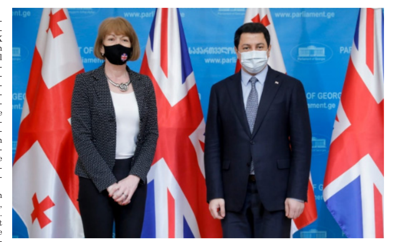
Minister Morton at the meeting with the Chairperson of the Parliament of Georgia Archil Talakvadze.

Following the agenda, Morton also visited the village of Odzisi, located near the occupation line. She announced on the site that the UK condemns the effective control and destabilization exercised by Russia over the occupied territories of Georgia.