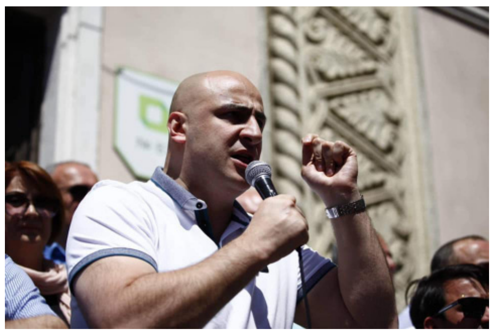
According to Melia, the political climate in the country worsens every hour