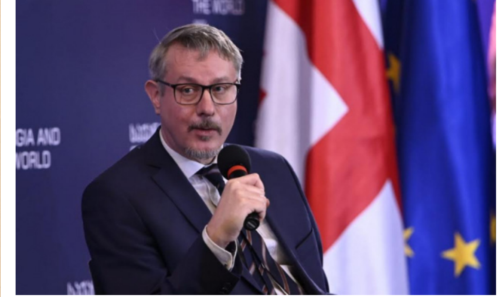
EU Ambassador to Georgia Carl Hartzell noted that the document adopted a century ago underlines Georgia's European values