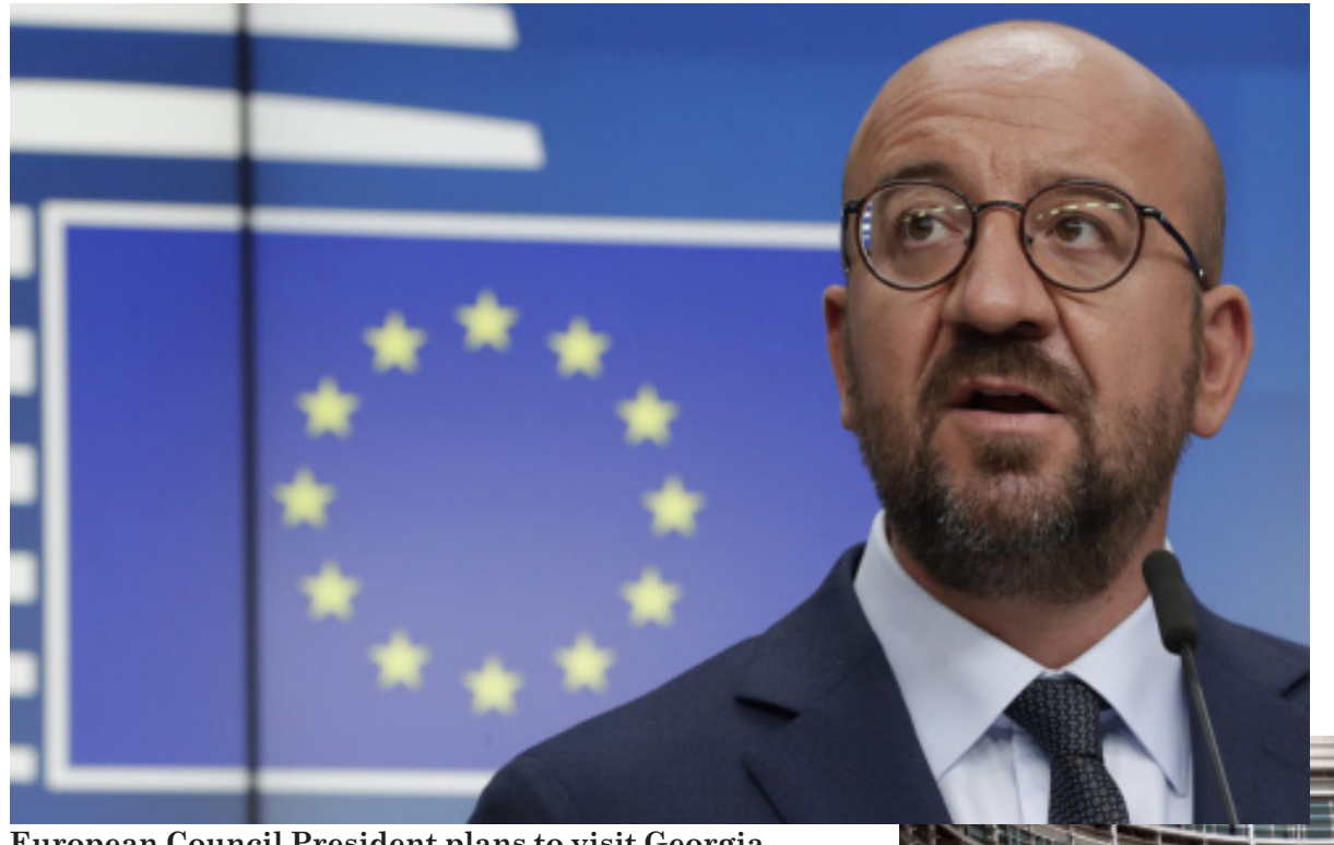
European Council President plans to visit Georgia, Ukraine, and Moldova