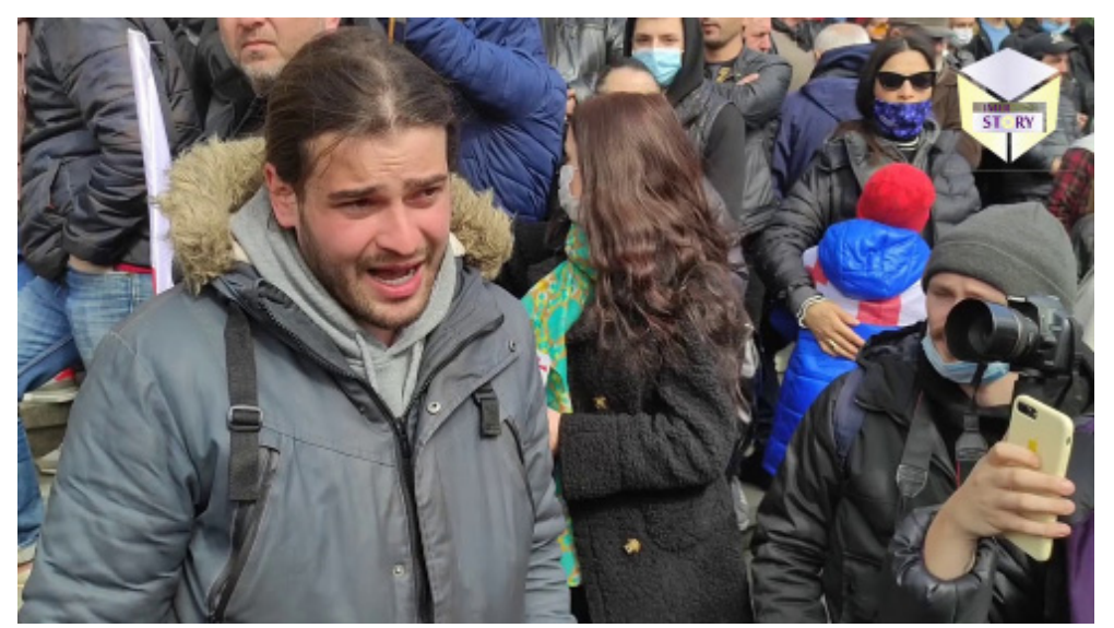
If the demands are not met, protesters are planning to hold another rally in two weeks

The Namakhvani Cascade project envisages the construction of two independent HPPs in Rioni Valley: Kvemo Namakhvani HPP (333 mV) and Zemo Namakhvani (100 mV). The annual output of the cascade - 1,500.00 GWh, which represents 12% of annual consumption.