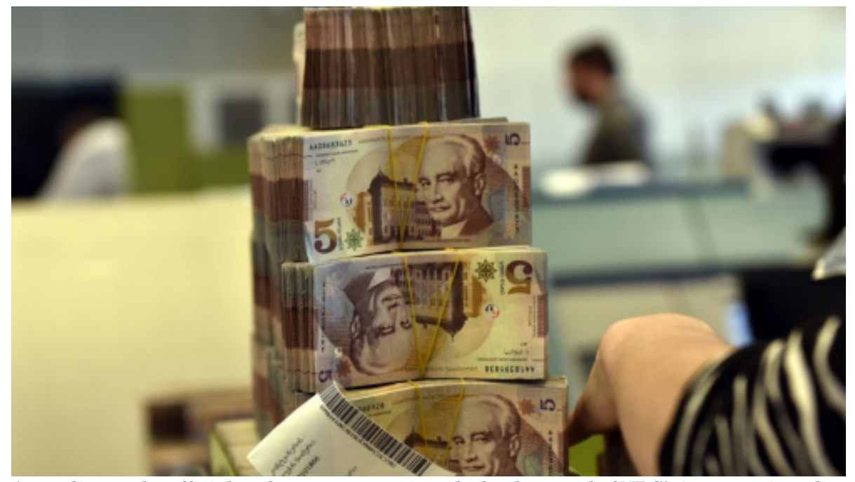
According to the official exchange rate, against the background of NBG's intervention, the lari strengthened by 0.27 tetri against the US dollar and the value of 1$ became 쓴 3.3299.