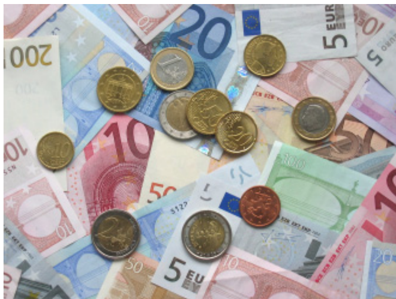
MIA has detained 11 individuals for helping embezzle €620,000 belonging to German, Austrian, Chinese, Dutch, and Norwegian citizens.

The Georgian Prosecutor’s Office has charged 10 Georgian and one Israeli citizen with fraudulent embezzlement of large sums of money belonging to foreign nationals, tampering with personal data, and money laundering.