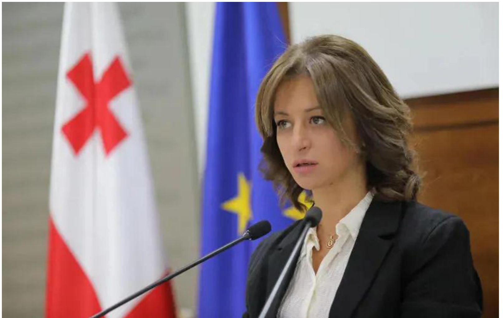
Health Minister of Georgia Ekaterine Tikaradze

The nationwide vaccination program in Georgia began on March 15, and it is currently conducted using AstraZeneca and Pfizer vaccines. The country has recently acquired doses of Sinopharm vaccines, but it will not be used until it receives official approval from the WHO.