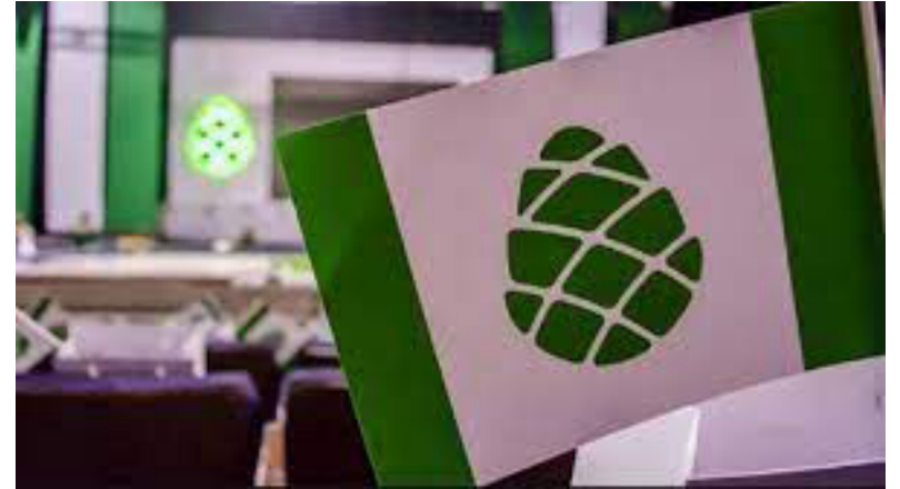
According to Girchi, they continue boycotting differently by refusing salaries or the state party funding and participation in any parliamentary sessions, commissions, committee sittings, procedural activities, and international business visits.

If the ruling GD party fulfills at least one of the proposed demands, Girchi will enter the legislature.