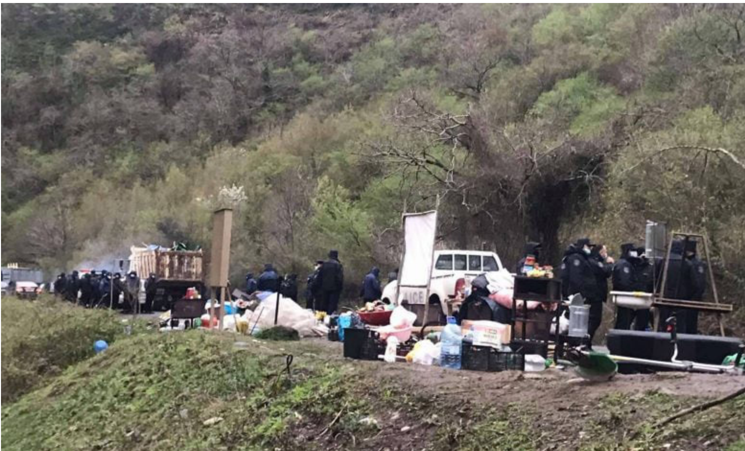
Police dismantling activists' tents in Namakhvani village, Imereti, April 11, 2021.

Georgia's Public Defender also called for the government authorities to schedule a meeting with the protestors as soon as possible, hold a series of transparent and result-oriented discussions with the interested parties until all questions and uncertainties are addressed successfully, have the police immediately ensure the people's right to freedom of movement and freedom of assembly, and ensure the readiness of all interested parties to participate in media discussion and debates to keep the general public informed on the matter.