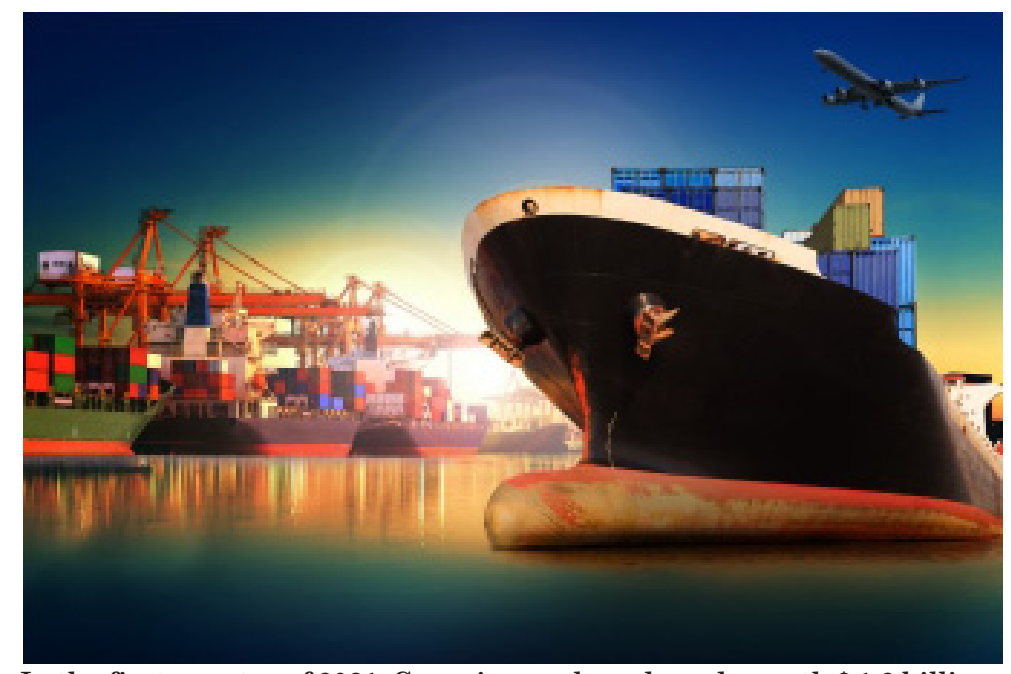
In the first quarter of 2021, Georgia purchased goods worth $ 1.9 billion from around the world.

In the first quarter of 2021, copper ores and concentrates ranked first in the top 10 exports of commodity groups with $