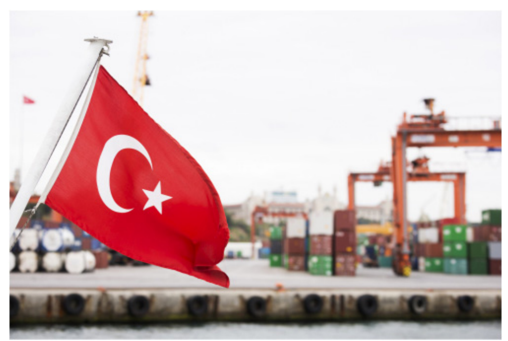
In January-March, the share of EU in Georgian Exports was 19.1%, the share of CIS countries - 44.7%.