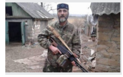
FULL STORY ON Page 2