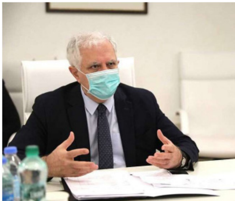
Other than the online platform, registration for vaccines is possible via the hotline 15 22.