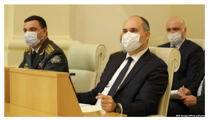
▶ Defense Minister also discussed cooperation with France. Intro: Burchuladze also answered the questions of MPs

According to Burchuladze, only coordinated action, maximum public involvement, and effective use of available resources can increase the responsiveness to military aggression and limit the possibility of intervention by the enemy.