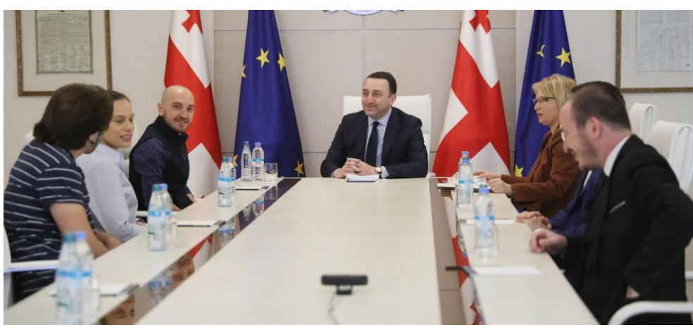
▶ PM met with the founders of Pulsar AI, a Georgian startup that entered the world market.

S pinCar, one of the leaders in digital sales systems in the automotive industry, has acquired the Georgian startup Pulsar AI. As a result of the deal, the value of the Georgian company is already several tens of millions of dollars. By combining Pulsar's virtual sales assistant technology with SpinCar's industryleading digital merchandising offering, the company will expand its solution set to drive greater levels of online shopper engagement.