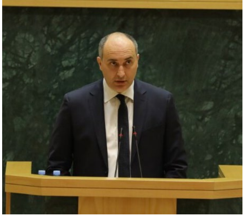
▶ Among others, Burchuladze talked about the cooperation with the largest military industry of Israel.

Burchuladze also spoke about the agreement with France and the ongoing negotiations. According to him, under this contract, the Defense Forces already have French-made air