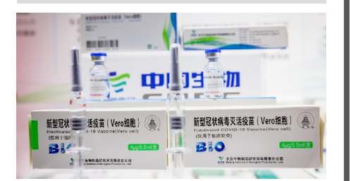
FULL STORY ON Page 2

Registration for the Chinese Sinovac vaccine starts today