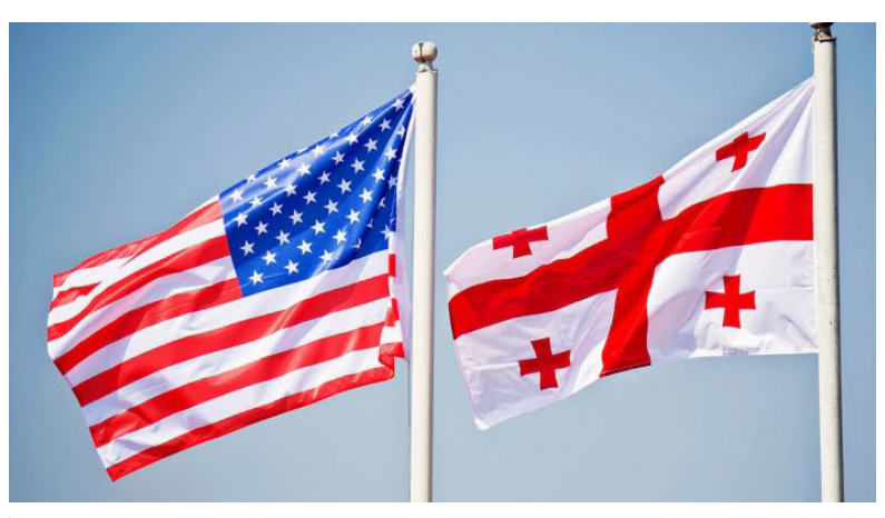
▶ The US senate reaffirmed support for Georgia's territorial integrity and its Euro-Atlantic aspirations.

The resolution also calls on the Government of Georgia to implement systemic reforms, developed through an inclusive and