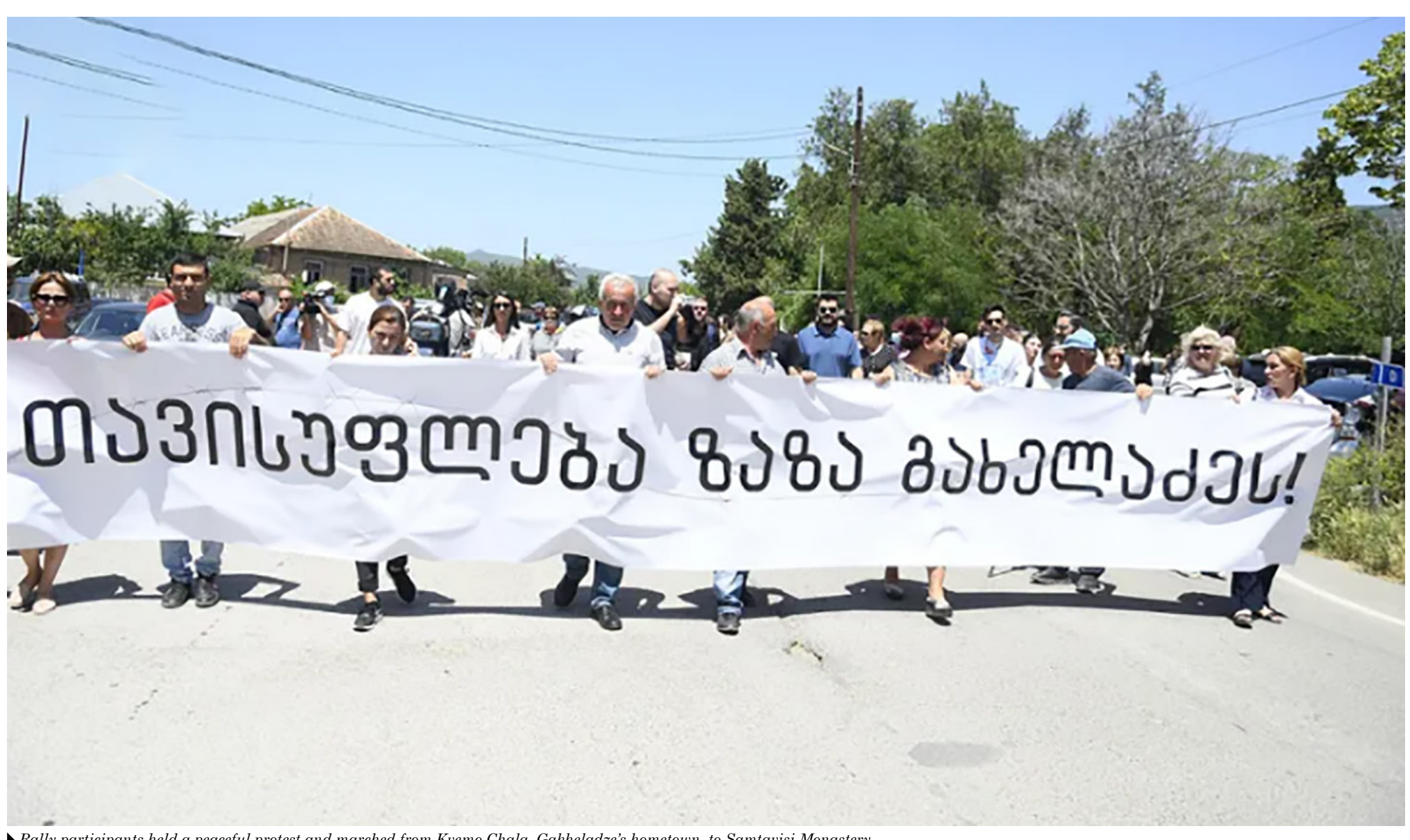
▶ Rally participants held a peaceful protest and marched from Kvemo Chala, Gakheladze's hometown, to Samtavisi Monastery.