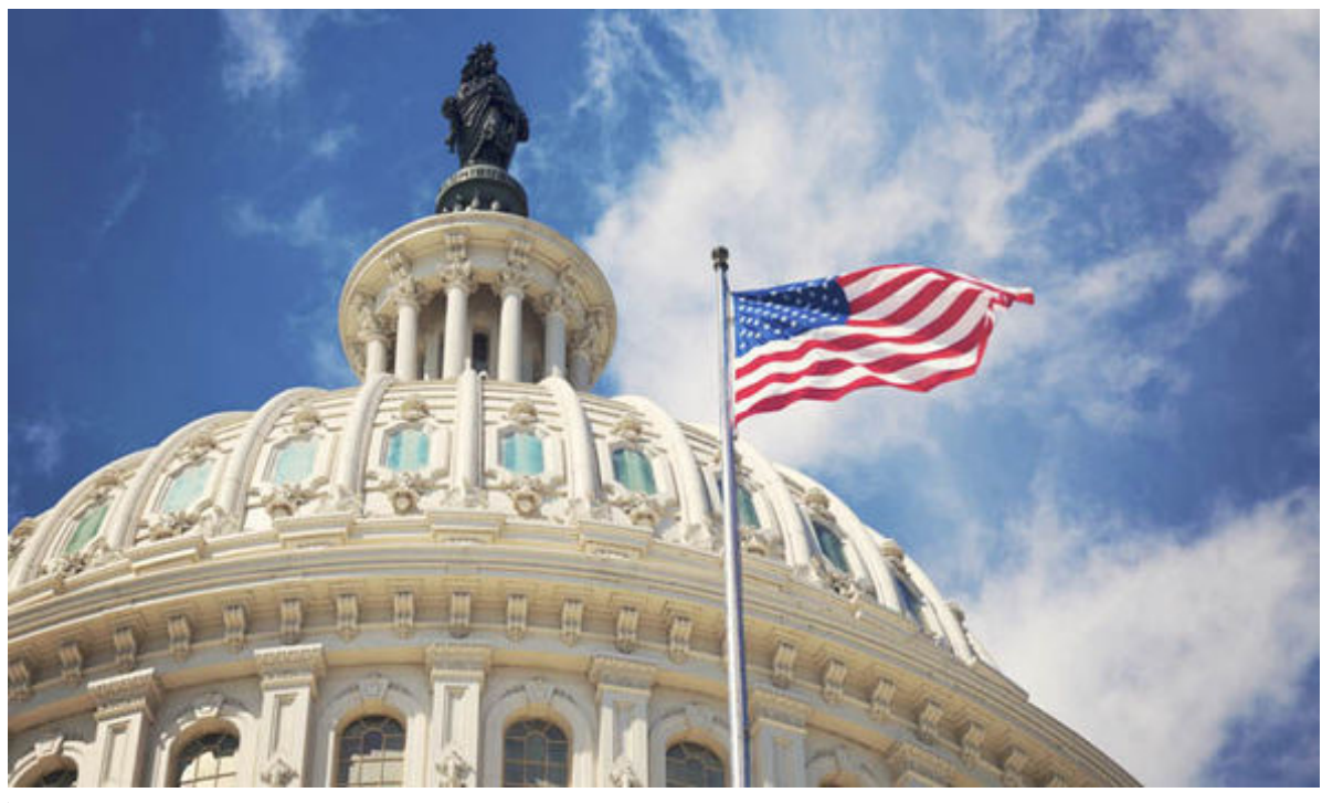
▶ The US senate reaffirmed support for Georgia's territorial integrity and its Euro-Atlantic aspirations.