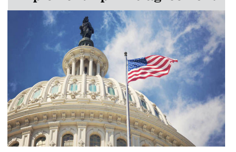
FULL STORY ON Page 3

US senators call on Georgian political parties to promptly implement April 19 agreement