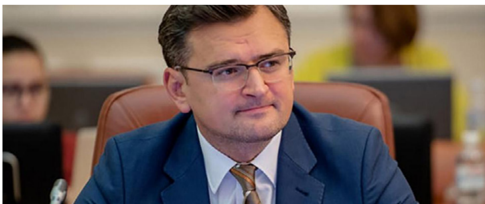
► According to Dmytro Kuleba, one of the reasons for creating the 'Associated Trio' is to change the situation, to set its own agenda and be more proactive.

"One of the reasons for the establishment of the Associated Trio is to change the situation. We need to set our own agenda, we need to be more proactive," said Ukrainian Foreign Minister Dmytro Kuleba. According to him, this is the first case when the European Union did not offer a format for relations with the Eastern Partnership countries, but the Eastern neighbors came to them in their own format.