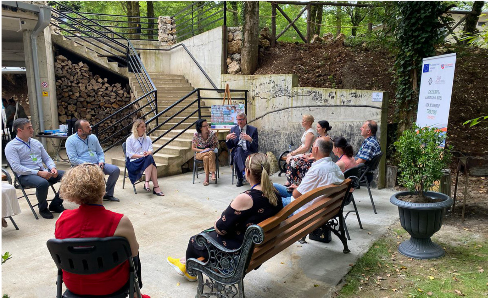
► Ambassador held a meeting in Imereti, with Tskaltubo Local Action Group, LAG

EU AMBASSADOR ONCE AGAIN DEMONSTRATED EU SUPPORT TO GEORGIAN REGIONS