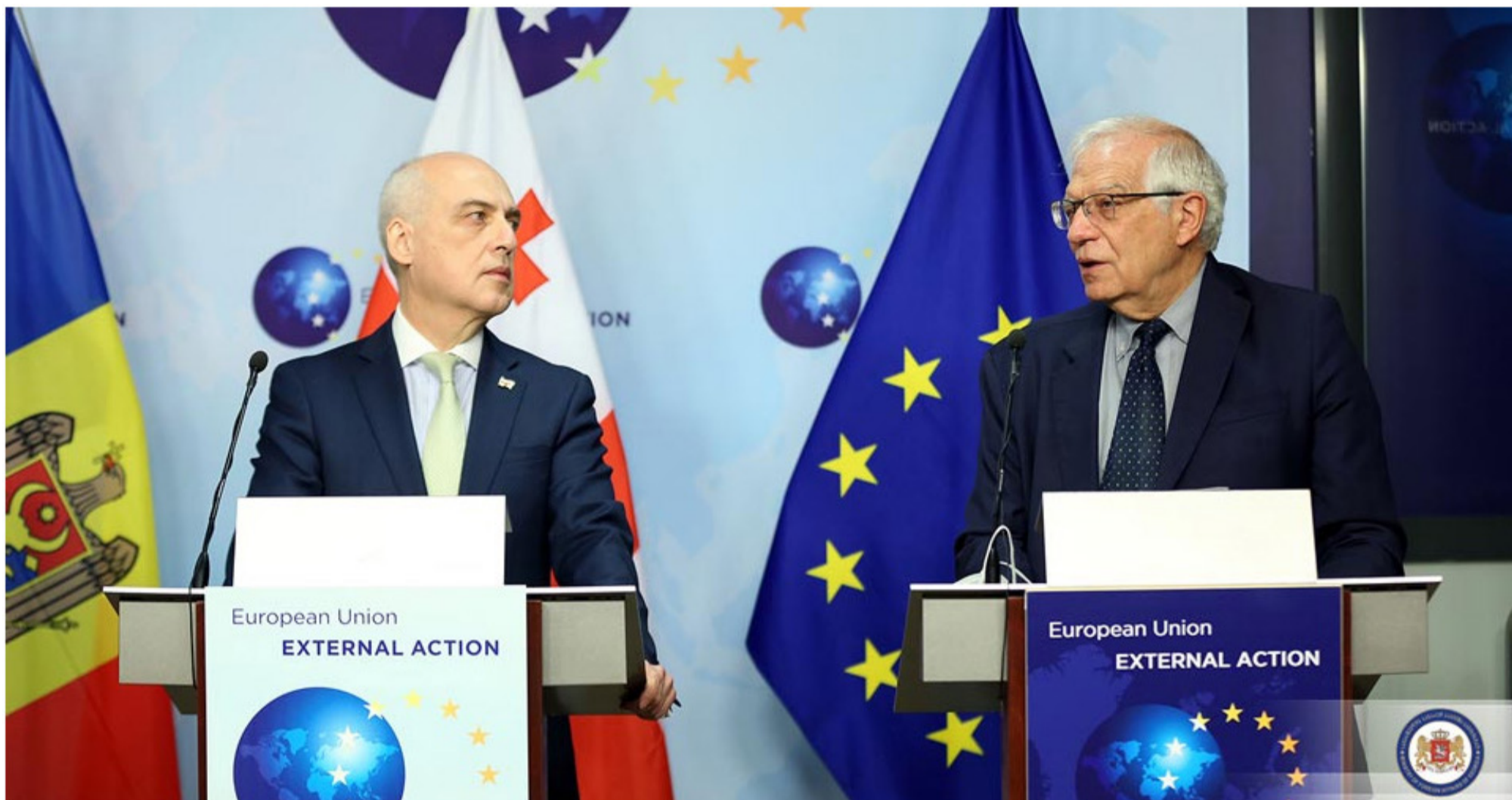
► Joseph Borrell: EU should be proud that our partners want to move closer to and join the EU.