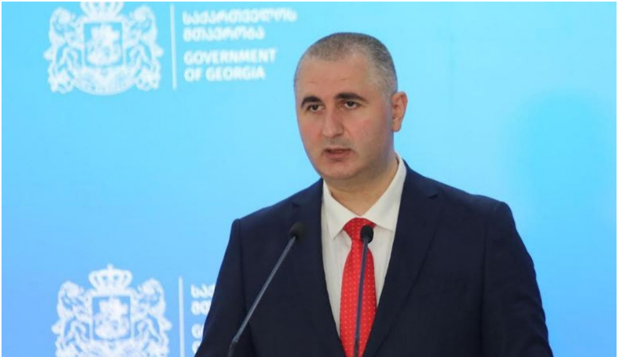
► According to the finance minister, 25.8% in May indicates double-digit annual economic growth.