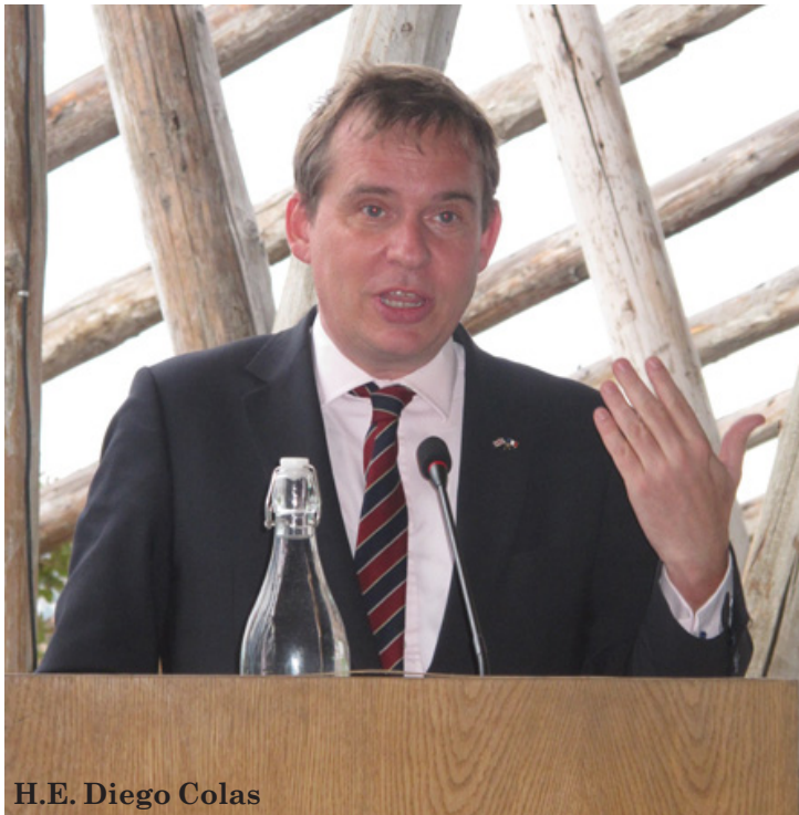
H.E. Diego Colas

The Generation Equality movement was launched this year by the initiative of the UN. It is creating a new space in the fight for women’s rights and gender equality in a reality transformed by the challenges of COVID-19. The global initiative is based on the comprehensive document on the protection of women’s rights – the Beijing Declaration and Platform for Action.