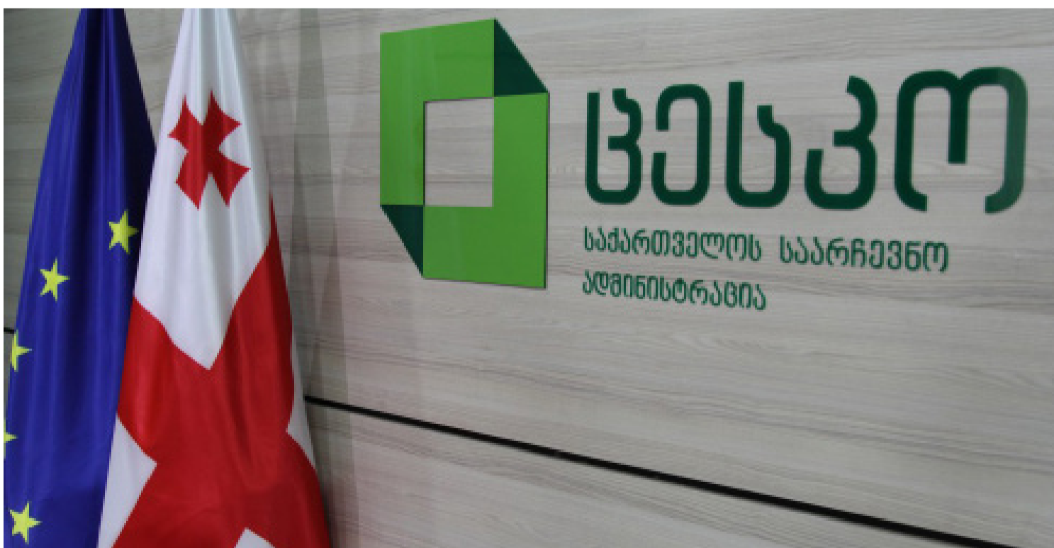
► Tamar Zhvania was appointed on the post in 2013 and re-appointed for the second term in 2018.