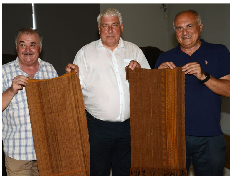
► Georgian National Museum notes that together with the German Archaeological Institute, they continue to study artefacts and inventions of the prehistoric era, including the production of fabric.

Georgian National Museum and German Archaeological Institute have been collaborating for many years. In 2018-2019, Frankfurt Archaeological Museum hosted a large-scale exhibition "Gold and Wine - Georgia's Oldest Treasures". The exhibition displayed rich archaeological material, including fragments of fabric found in the N3 burial mound in Ananuri, dating back to the third millennium BC. The conservation of fragments was funded by the Shota Rustaveli National Science Foundation of Georgia. According to the Georgian National Museum, patterns from such an old era are very rare to find. The idea of making similar fabric by using modern techniques and technologies was born while preparing for an exhibition in Germany. An animation was also created for the same exhibition, which demonstrates