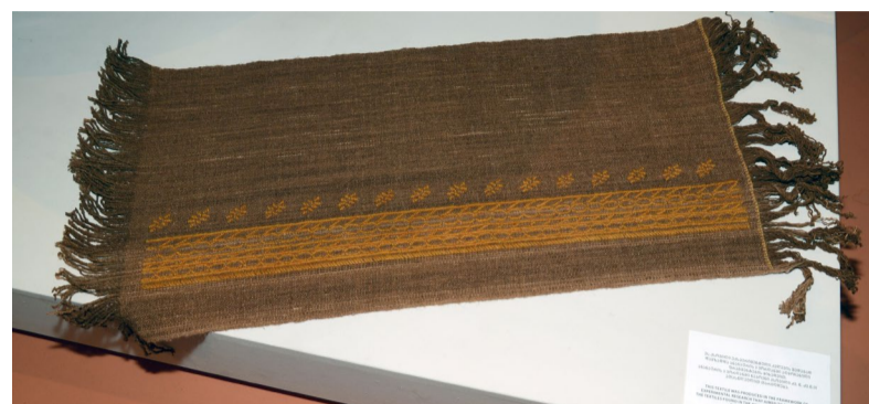
► "The indicated fabric was created as a result of experimental research according to the fragment of fabric found in 2012 in Lagodekhi burial mound, dated from 3rd millennium B.C.," Georgian National Museum says.

a detailed reconstruction of the burial mound.