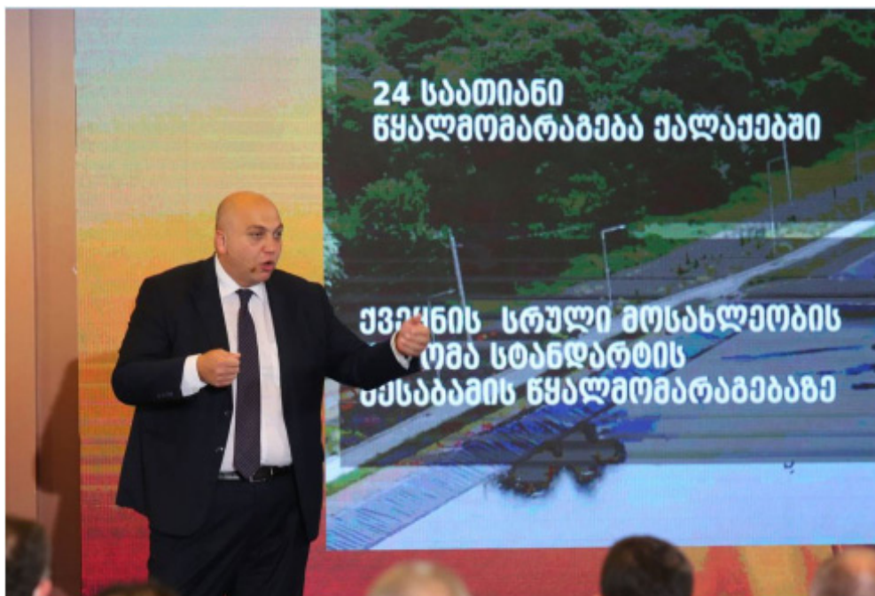
In the very first year of the VAT distribution reform, municipalities received ₾ 100 million more in revenue. By 2025 revenues of the municipalities will become less than 7% of the GDP, which means the allocation of more than ₾ 1 billion additional resources.

By 2025, the construction of all major sections of the highway will be completed, and by 2030, a total of 760 km of highways will be finished. By the same time, 97% of roads of international importance and 93% of domestic roads will be rehabilitated. Work on the Rikoti Road project is intensive. Currently, 71 out of 96 bridges are being built simultaneously, and 47 out of 53 tunnels, of which 8 tunnels have already been cut. The 2.5 km section of the new road, which consists of