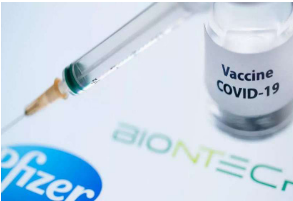
Vaccination with the first dose of Pfizer started yesterday in Georgia among people aged sixteen and over. There are 37 medical facilities engaged in the immunization process.

On Monday, Georgia reported 1,264 new cases of coronavirus, 1,665 recoveries, and 11 deaths. There have been 404,023 cases of coronavirus since February 26, 2020, with 374,753 recoveries and 5,714 deaths. Currently, 23,530 individuals remain infected with Covid-19.