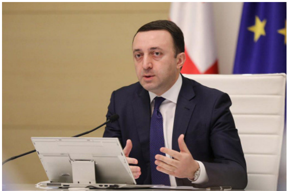
Garibashvili stated that the state economy grew by 12 percent in the first six months of 2021, allowing the state to increase the budget by one billion Lari.

The PM underscored that currently there are 1.5 million doses of Chinese manufactured vaccines and half a million doses of Pfizer vaccine in the country. According to him, Georgia will also obtain an additional one million doses of Pfizer vaccine directly from the manufacturer in the following month.