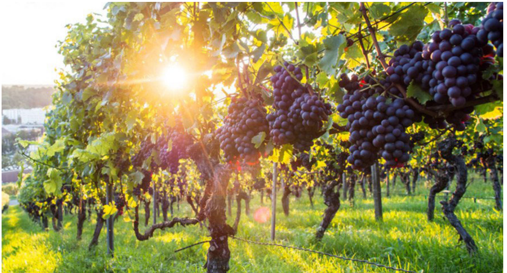
According to Prime Minister Irakli Garibashvili, the 2021 grape harvest will be subsidized due to an excess grape yield this year.

Garibashvili also expressed concern over the drug price rise, underlining that some drugs have 300-400% price tags, which, according to him, is unacceptable. "Nothing like this happens in any other country. We need to make relevant decisions shortly as the situation affects the well-being of our population," he noted. According to him, the Georgian National Competition Agency will present an interim monitoring report on this issue in the coming days.