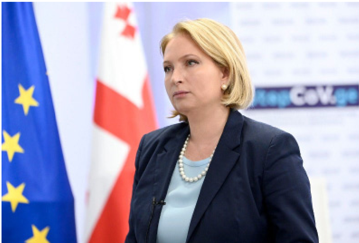
According to Economy Minister Natia Turnava, the loan subsidy project for multi-child families or families with newborns will last for five years.

As Prime Minister Irakli Garibashvili stated at the briefing on Monday, through this assistance program, families will be able to buy both an apartment or a private house. The PM also focused on subsidizing the 2021 grape harvest due to an excess grape yield this year, amounting to 300,000 tonnes. As PM noted the price of 1 kg Rkatsiteli wine variety will be no less than ₾ 0,90, adding that the wine companies will receive an additional ₾ 0,35 (per kg) from