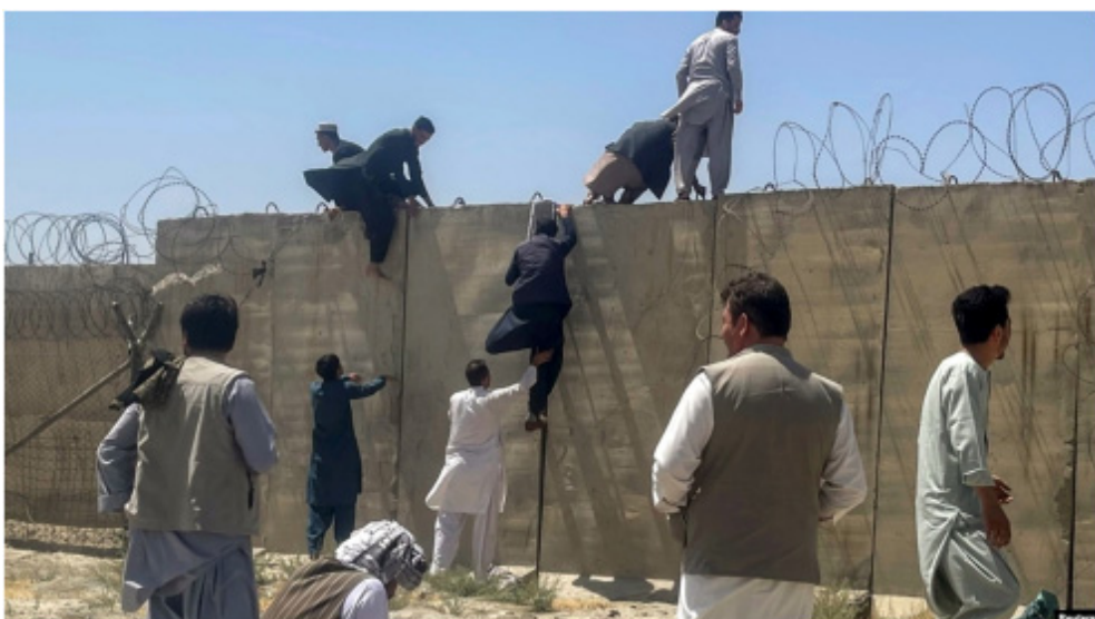
Tensions between the Taliban and Afghan government forces have escalated in the country since the US-led invasion of Afghanistan.