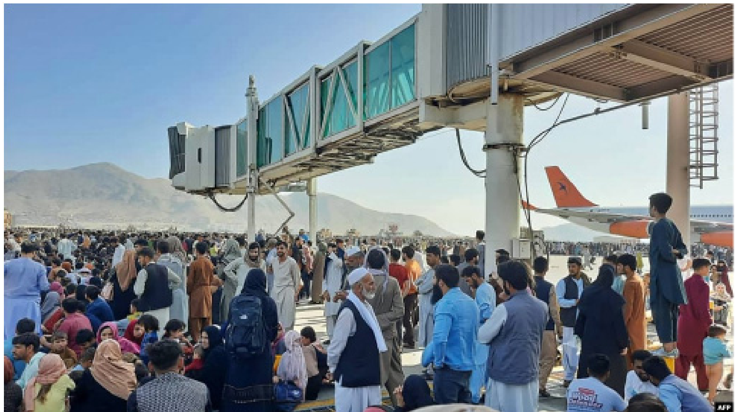
Foreigners and locals are leaving Afghanistan en masse due to the return of the extremist group Taliban to power.

"Given the deteriorating security situation, we support, work with and urge all parties to respect and facilitate the safe departure of foreigners and Afghans wishing to leave the country. Those in power in Afghanistan have a responsibility to