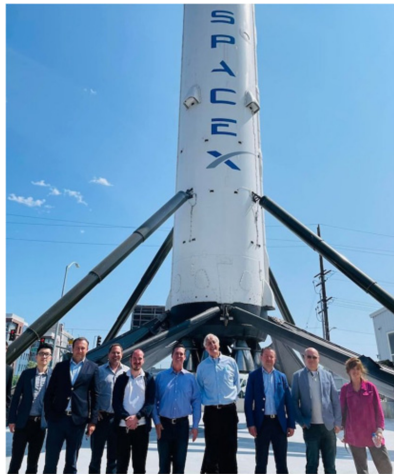
Space Exploration Technologies Corporation is an American space rocket manufacturer. The company was founded in 2002 by Elon Musk.