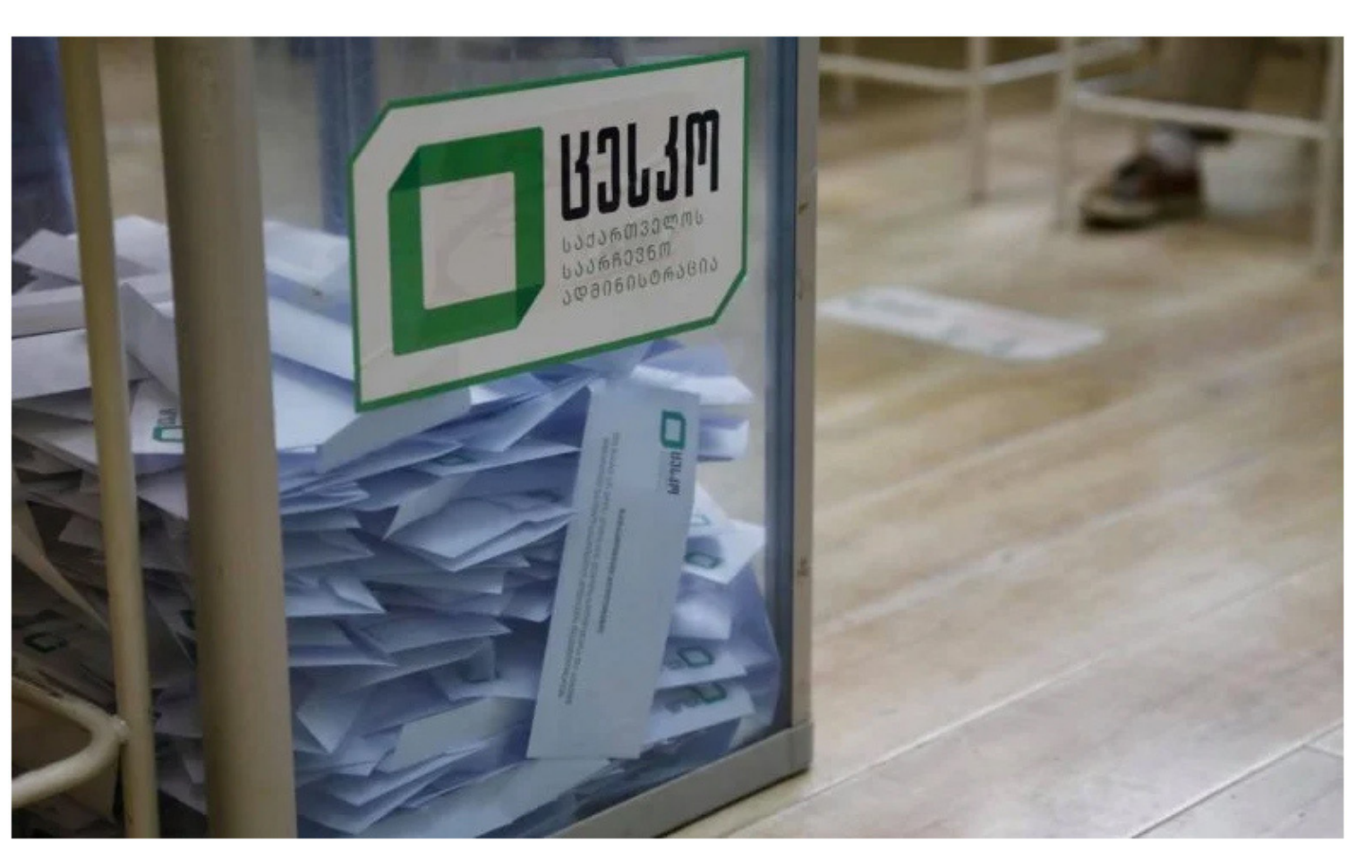
OSCE/ODIHR says that contestants were able 'to campaign freely in a competitive environment' that was, however, "marred by wide-spread and consistent allegations of intimidation, vote-buying, pressure on candidates and voters, and an unlevel playing field."

In the statement, the U.S. Embassy also commended the work of professional domestic election observation organizations, in