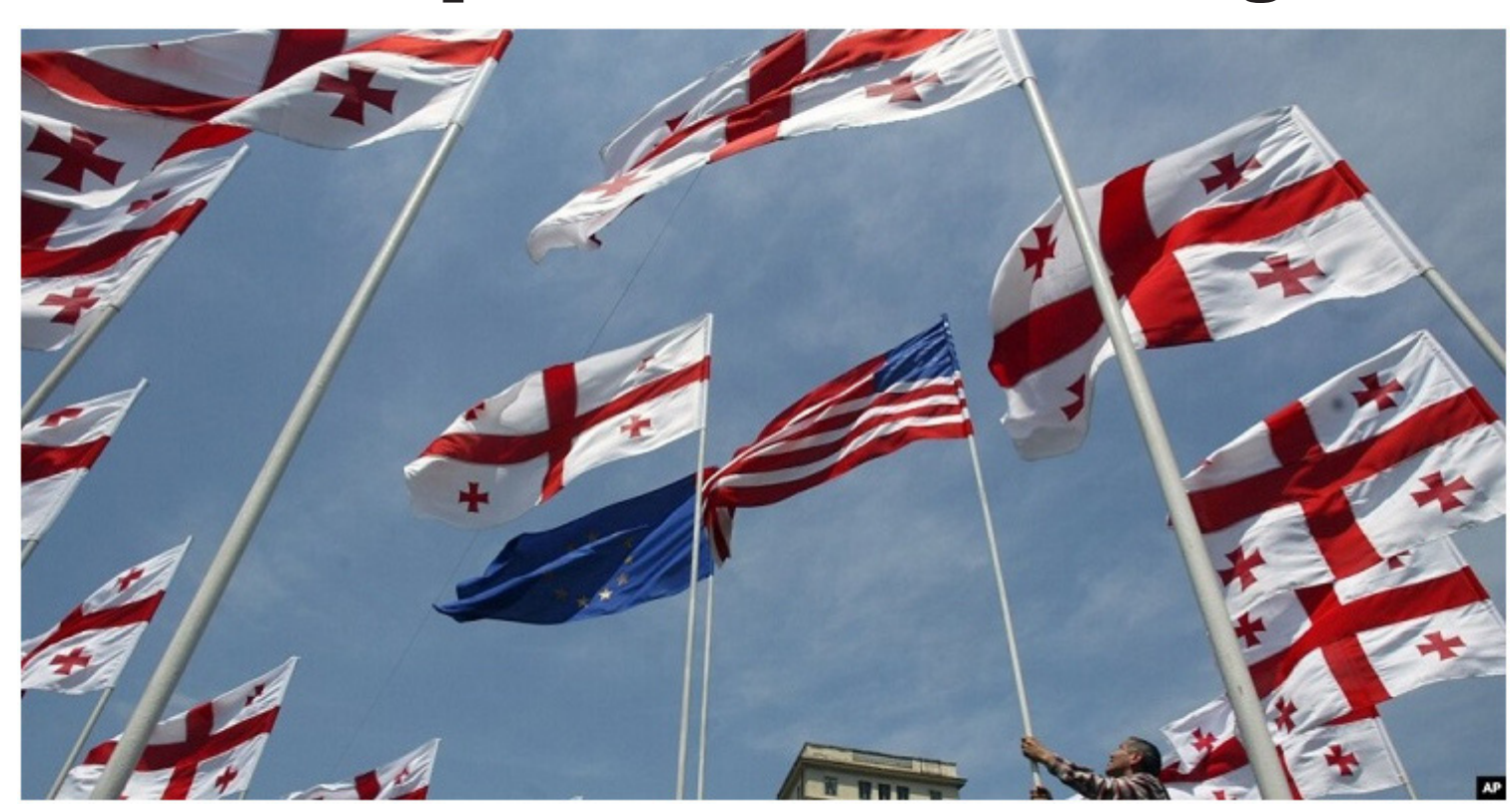
"The current polarisation continues to have a negative effect on Georgia's democracy – all parties have a responsibility to address this."

law enforcement officers, and other public sector workers reportedly interfered with their ability to exercise their free choice on Election Day, adding that 'this type of abuse has occurred too often in Georgian elections and is wholly incompatible with Georgia's democratic and Euro-Atlantic ideals.'