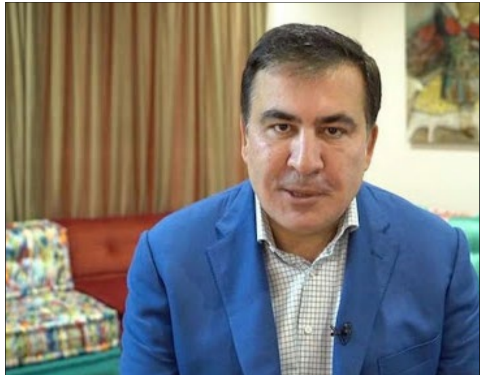
► Saakashvili has been on a hunger strike since his arrest on October 1.