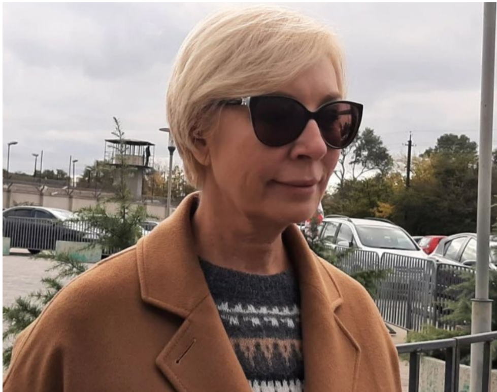
► Ombudsperson of Ukraine visited Saakashvili in prison.