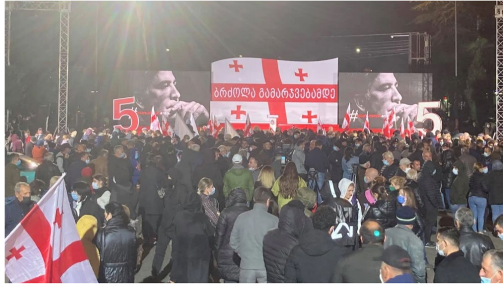
► "Fight for Victory, Fight for Misha's Freedom"

According to results, the GD mayoral candidate is leading in 1 of the 5 cities - Tbilisi, while the National Movement is leading in the remaining 4. According to the study, the difference between the candidates is in some cases so small that, given the margin of error, the