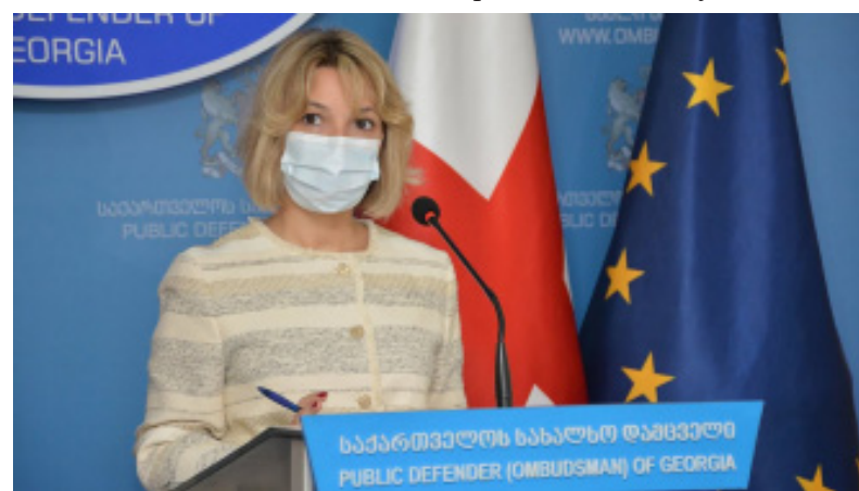
The videos were assessed negatively by the Ombudsperson of Georgia