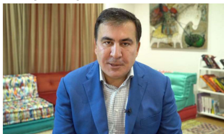
Saakashvili has been on a hunger strike since his arrest