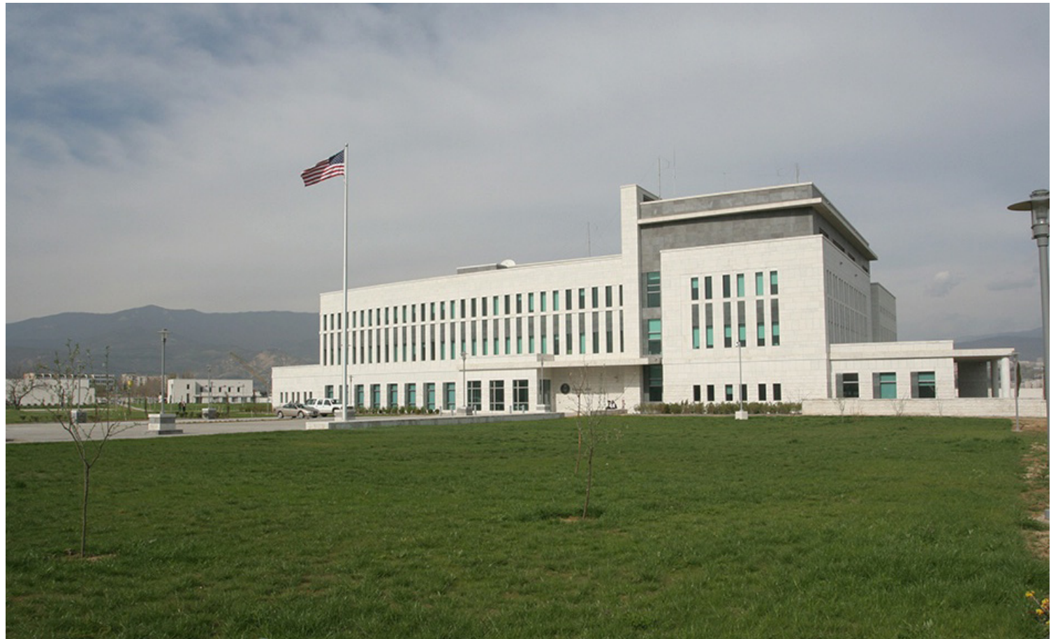
US Embassy says they are disappointed in the process

"The exclusion of independent voices from this process adds to the impression that Supreme Court judicial appointments are being made without meaning-