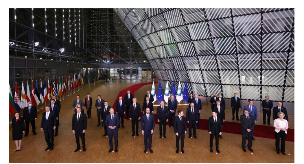
▶ The EU together with these 3 countries will explore options for enhanced sectoral cooperation such as: the twin green and digital transitions, connectivity, energy security, justice and home affairs, strategic communication and healthcare.

At the end of the summit, participants noted their commitment to shared values, accountability, inclusiveness and diversity. They condemned the actions of the