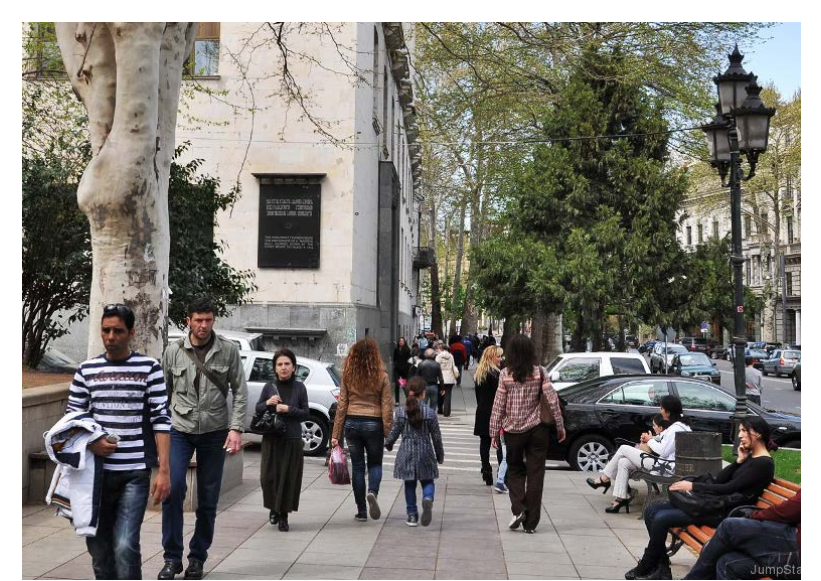
Economy Minister stated that overcoming poverty in the country is one of the key

'one of the most important issues' the Georgian population currently faces. She noted that in 2021 the inflation rate in the country 'instantly tripled,' due to the global pandemic. "As a result of the coordinated and targeted policy of the government and the National Bank (NBG), the NBG and the Inter-