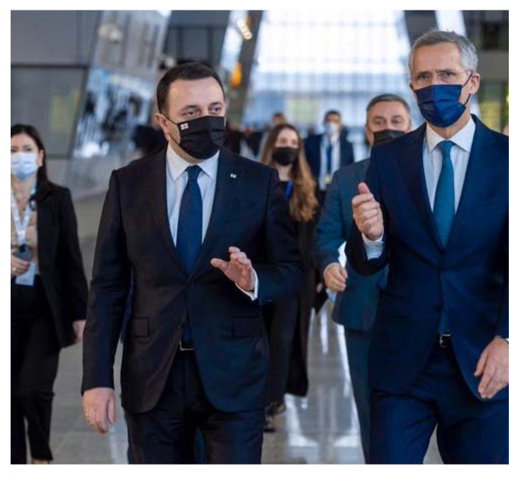
• "We continue to call on Russia to stop recognizing the independence of Abkhazia and South Ossetia and to withdraw its military forces," Stoltenberg said.

"We agreed that NATO would be very vigilant to prevent further escalation. Any further aggression by Russia will have a high price and at the same time will have very serious political and economic consequences for Russia. Georgia and Ukraine