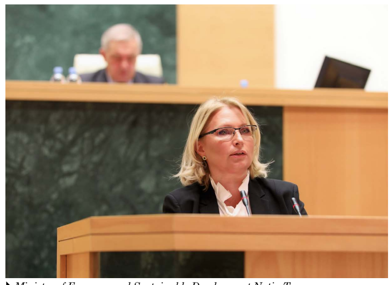
▶ Minister of Economy and Sustainable Development Natia Turnava.