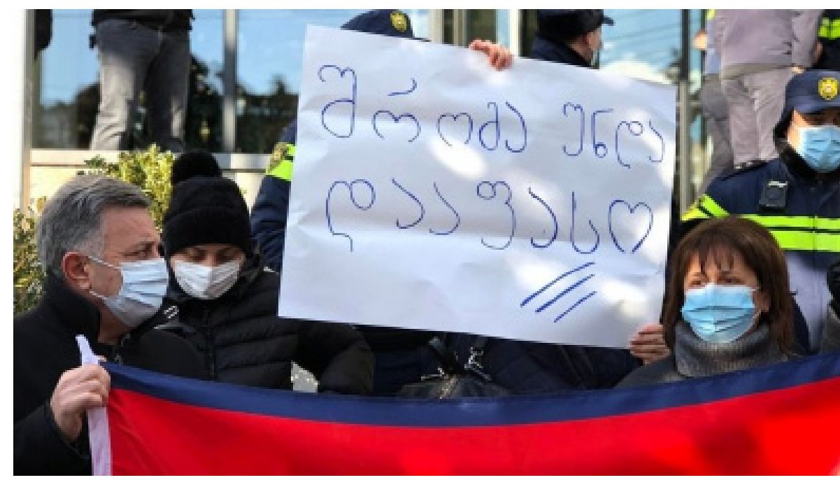
The agency management promises a 60% increase in fixed and output-based remunerations from next month, although this promise is not enough for the strikers.

"Due to their functions and workload and the working day, we think we made the appropriate decision last week and in some cases there is a 60% salary increase. In addition to salary, they can earn income for each completed declaration. In