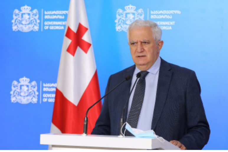
According to the Head of NCDC Amiran Gamkrelidze, it is expected to enter another peak of the pandemic at the end of February with 10-15 thousand positive cases per day.

Public Health (NCDC) Amiran Gamkrelidze said, the Omicron version is characterized by rapid transmission and tripled reinfection rate, noting that out of 1254 confirmed omicron cases, approximately 17-20% are re-infected. According to him, 50% of positive cases in the country are Omicron strain and the highest number, 65%, is recorded in Tbilisi. Gamkrelidze stated that the cases of the new strain are relatively mild compared to