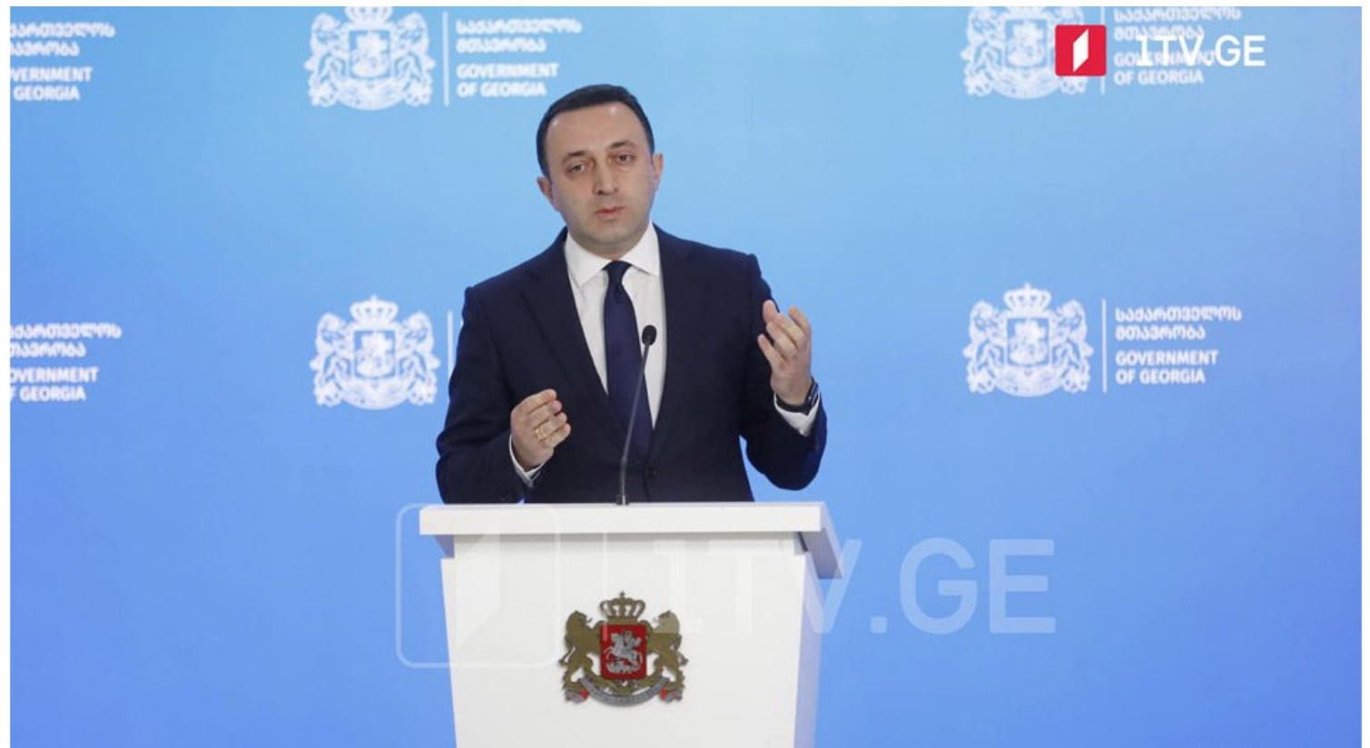
PM opens commissions for selecting Special Investigation and Personal Data Protection services chairs.

According to him, since GD governance, various accommodation programs, alternatives, have been launched in