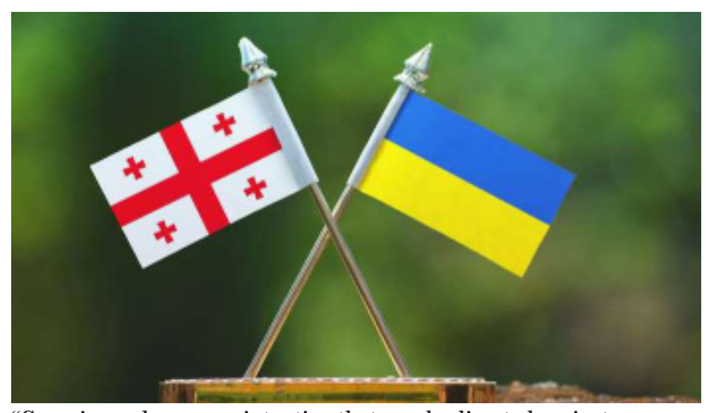
"Georgia condemns any intention that may be directed against the territorial integrity of the sovereign state, which poses a new threat not only to Ukraine but to regional peace and security," the resolution reads.