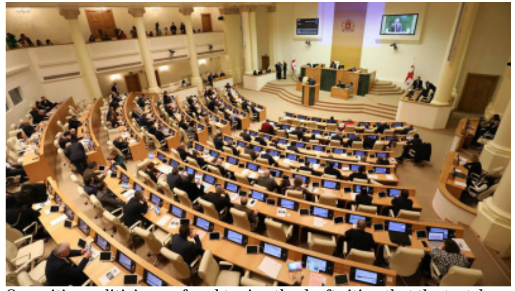
Opposition politicians refused to sign the draft citing that the text does not mention Russia as the aggressor country.

"The Georgian Parliament declares that joining NATO is a sovereign right of the state and any attempt to restrict it by military-political means is categorically unacceptable. The Parliament believes that the prevention of war in Ukraine should be a major concern for the international community," the resolution reads.