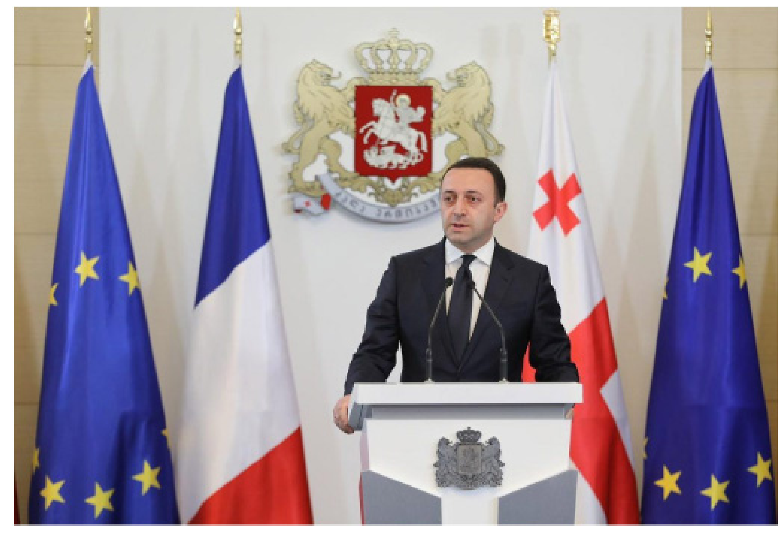
PM Gharibashvili tested positive for the omicron variant of Covid-19. The head of the government tested positive for coronavirus previously in April last year.