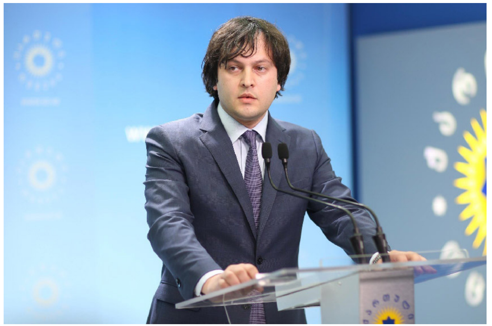
Kobakhidze stresses that Georgia aims to contribute to the prevention of the war, which, according to him, "is not easy."

Foreign Ministry announced that a hotline had been activated for Georgian citizens in Ukraine, noting that Georgian diplomatic representations are in constant communication with Georgian citizens. According to the Ministry, due to the high risk of escalation of tension and probability of invasion, Georgian Embassy in Kyiv and Consulates in Odessa and Donetsk are transformed onto an emergency working regime.